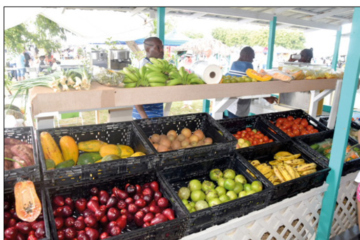
► Produce of all kinds