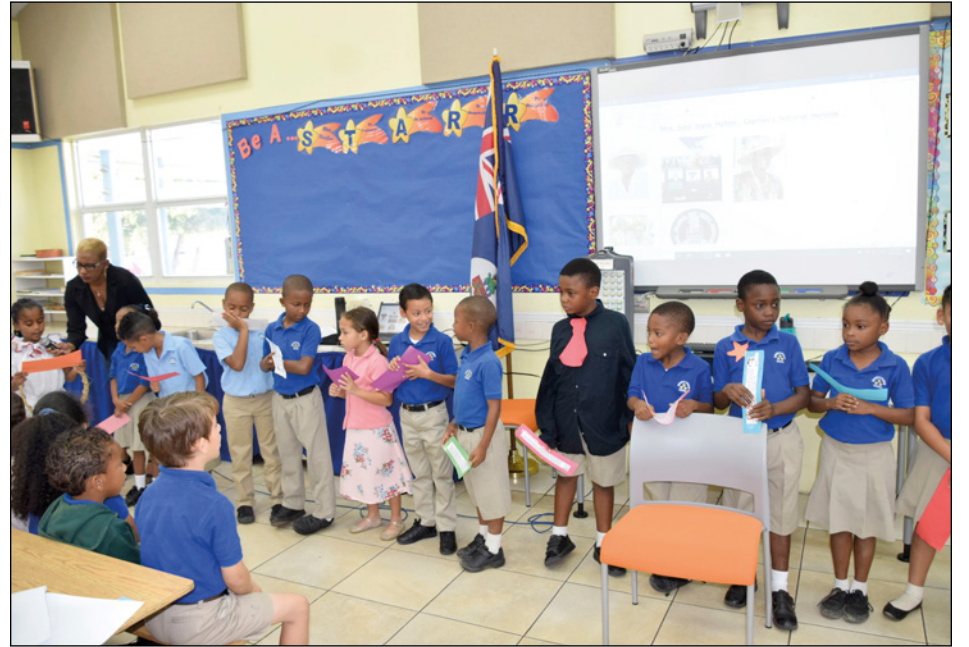
► National Heroes Celebrated at Savannah Primary