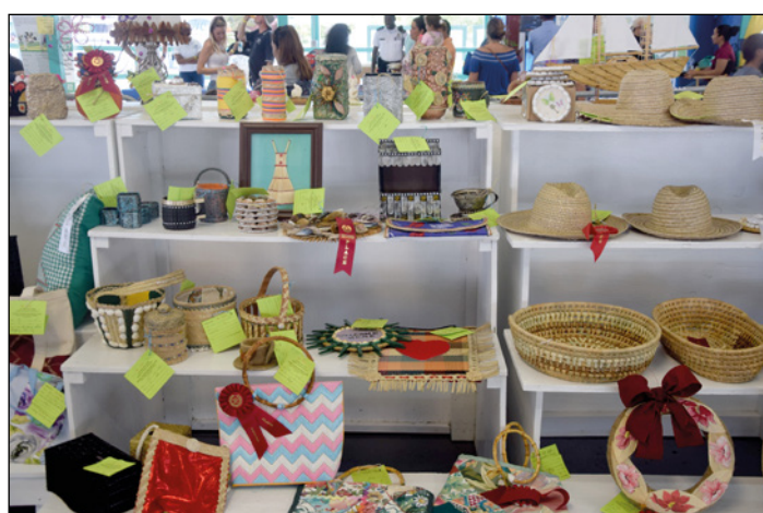
► Thatch work and crafts