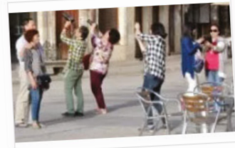
Cuba relies on Chinese for tourism