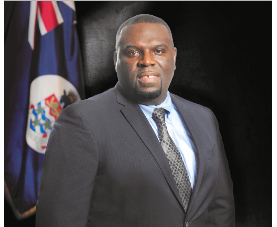
► Hon. Dwayne Seymour, Minister for Health, Environment, Culture and Housing

In any travel abroad, the Public is advised to practice general infection control measures.