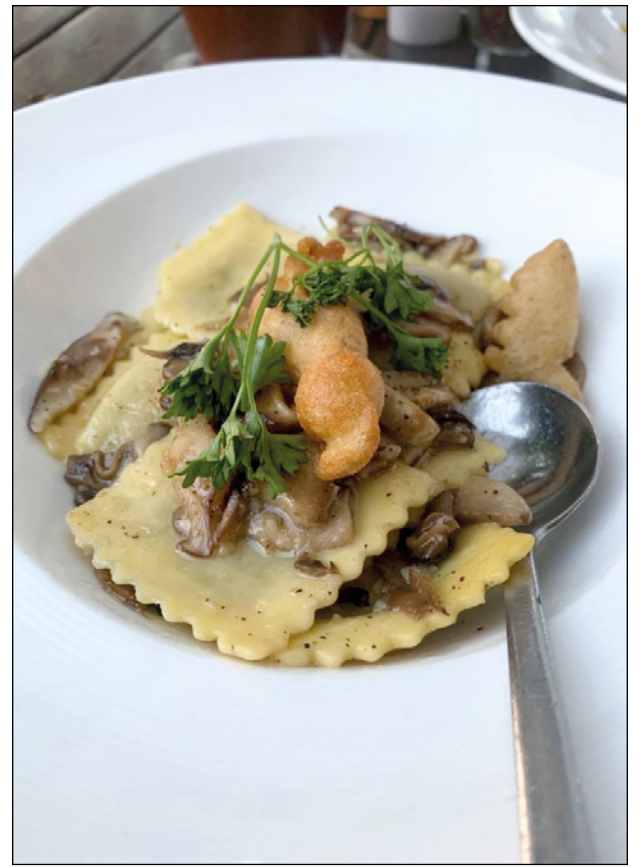
► Taste of Cayman Mushroom ravioli