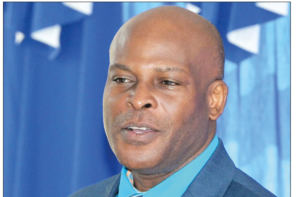
► Minister of Home Affairs Edmund Hinkson

He also appealed to homeowners to insure their homes, noting that Govern-