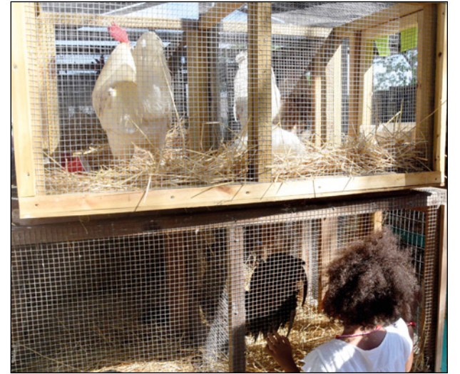
► All kinds of fluff- feathered and fancy fowl

and chickens, and the children love to come face-to-face with them. It was a very child-friendly event, and there was a special children's corner with slides and games, and there was a bouncy castle too. There weren't any pigs this year, sadly. When I asked one of the officials why, he said that the main pig farmer who usually brings them hadn't brought any this year. But there were plenty of horses, and children and their parents were lining up for horseback riding.