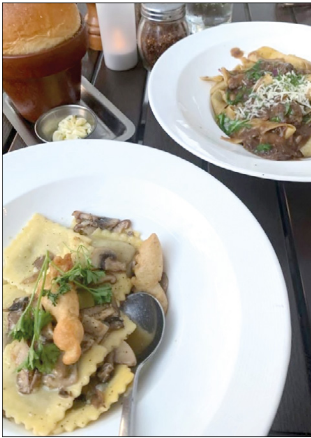
► Comforting bowls of pasta

zarella, marinara chilli chicken, tomato, green onion, salsa, sour cream, Cajun guacamole and nacho chips. I also liked the sound of the 'fun guy' ('fungi', get it?) pizza of portobello, button and shitake, along with basil, truffle oil, shaved parmesan, mozzarella and parmesan cream sauce, but in the end opted for a comforting bowl of pasta. I considered the butternut squash ravioli but opted instead for the short rib pappardelle, which consisted of a house-made pappardelle, mushrooms, onion, fresh arugula, pecorino and red wine beef jus. It was delicious and to be honest, I could have eaten another bowl, but I guess if you leave wanting more than that is the sign of a good meal? The mushroom ravioli, complete with sautéed wild mushrooms, rosemary, white wine butter sauce, tempura mushroom was equally as good but equally not huge in its portion size. A pleasant surprise all round and definitely not a restaurant just for kids! 🍷