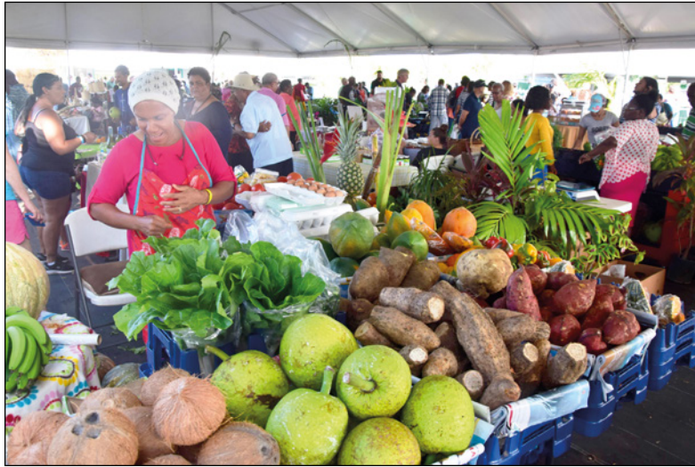
► Inside the main tent there was plenty of produce

Of course, moms and dads like to show young children the cows, goats,