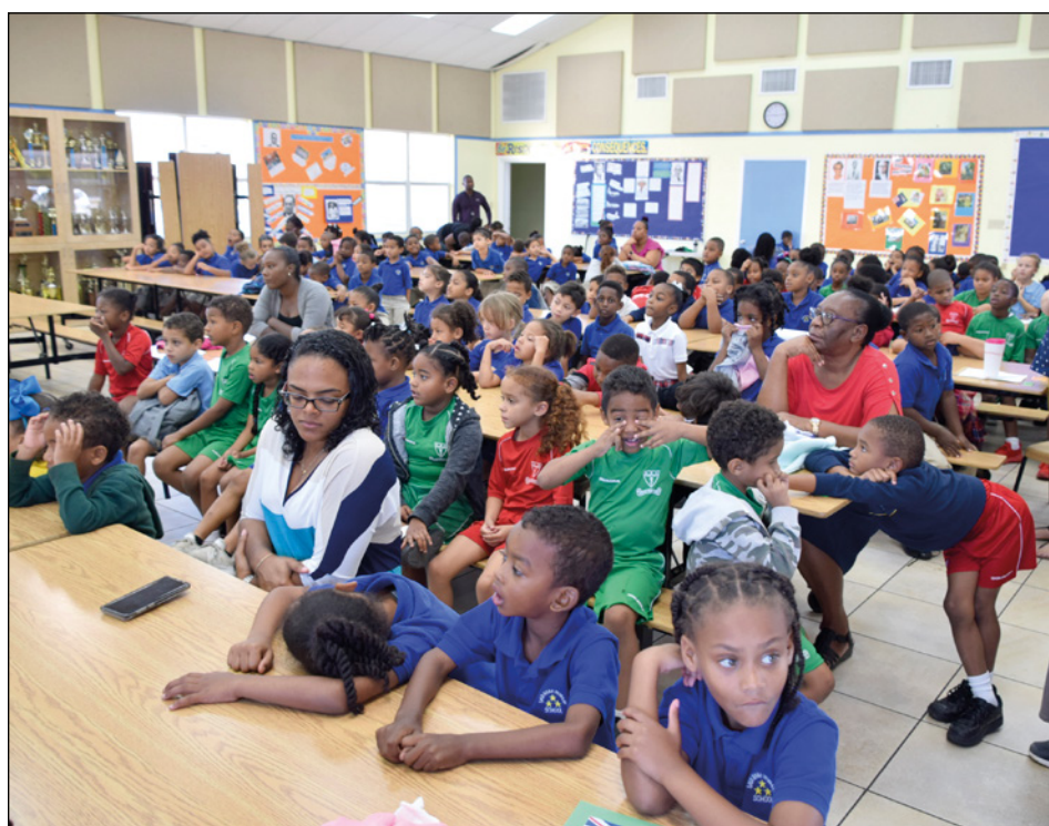
► Tomorrow’s heroes

a country, and those that have gone before us, our National Heroes for example, who have done a great job in paving the way for us. We’ve tried to organise today so that kids can access that information, in a way that they understand, and hopefully it’ll impact their lives as we unpack the lessons and learn from them.” 🌐