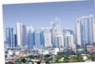
Philippines economy is rising