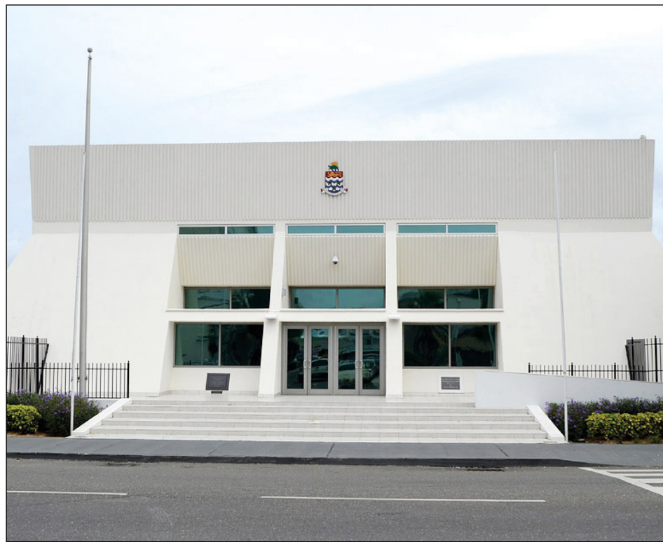
► Cayman Islands Legislative Assembly

was also the subject of industry consultation. The amendments were designed to maintain alignment with international standards and to facilitate effective implementation of the Law in a manner which can better withstand the scrutiny of international monitoring and peer reviews regarding the "substantial activities" requirement for no or only nominal tax jurisdictions under the OECD BEPS Action 5 on Harmful Tax Practices. 🌐