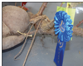
► First prize!

and chickens, and the children love to come face-to-face with them. It was a very child-friendly event, and there was a special children's corner with slides and games, and there was a bouncy castle too. There weren't any pigs this year, sadly. When I asked one of the officials why, he said that the main pig farmer who usually brings them hadn't brought any this year. But there were plenty of horses, and children and their parents were lining up for horseback riding.