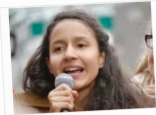
Murdered activist's daughter takes over