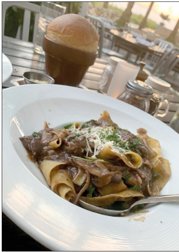
► Short rib pappardelle was a hit