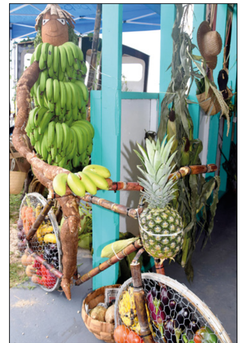
► Bobo the fruit-and-vegetable cyclist

No Agriculture show would be complete without mentioning traditional