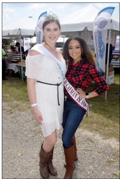
► The Agriculture Queen (left) and Miss Cayman Islands World