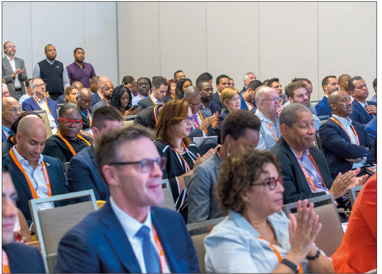
► Attendees at Caribbean Infrastructure Conference, January 21-22

The event, which was organized by New Energy Events and IJGlobal, was attended by private and public sector decision makers, utility representatives, multilaterals and representatives across the financing space from the Caribbean and other regions.