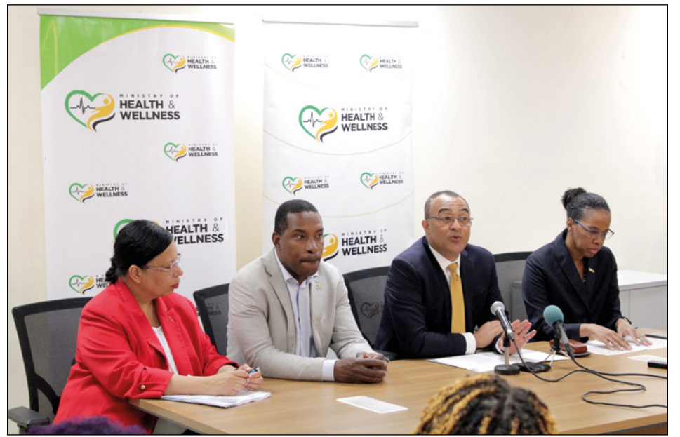
► Emergency Press Conference - Ministry of Health and Wellness Dr. the Honourable Christopher Tufton