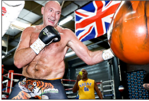
► Tyson Fury finally gets his wish to face Joshua