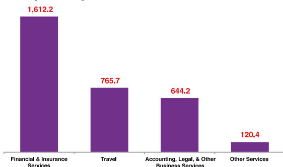
Foreign Exchange Revenue from Services in 2019, CI$Million

In 2019, total foreign exchange revenue from Cayman's export of services totalled CI $3.1 billion.