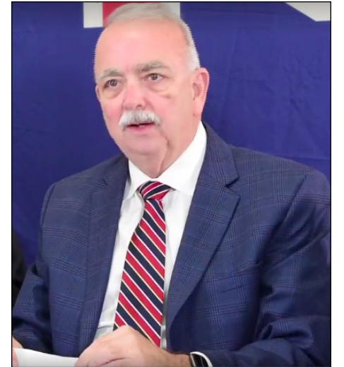
► Hon. Leader of the Opposition, Roy McTaggart

"The concern we have is in the new strains of the virus that we see developing in different parts of the world, and we need to tread carefully, so that we avoid