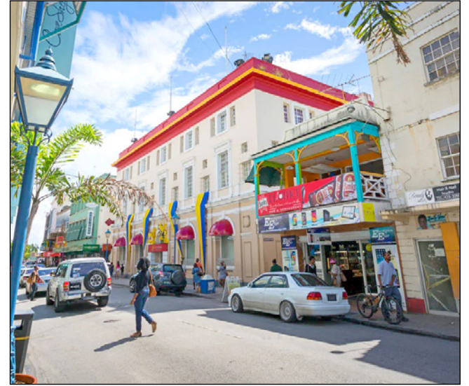
► Bridgetown is trying to adhere to financial protocols

Completing the full list of 21 countries are Albania, Burkina Faso, Botswana, Cambodia, Korea, Ghana, Iran, Mauritius, Morocco, Myanmar, Nicaragua, Panama, Senegal, Syria, Uganda, Yemen and Zimbabwe.