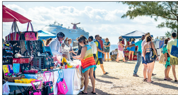
► Caribbean tourists are gradually returning