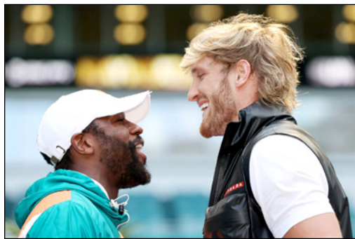
► Floyd Mayweather expects an easy - and lucrative - night's work

over 20 million subscribers. Paul stands six inches taller than Mayweather, with an 18-year age advantage, but he will be sharing the ring with a Hall of Fame fighter who was recognised as the sport's pound-for-pound No 1. Mayweather is so confident of victory, he even offered to take on Paul's antagonistic broke, Jake, on the same night. At the press conference to announce the fight last week, Jake grabbed Money's baseball cap which infuriated Mayweather who is expecting to earn at least $10 million.