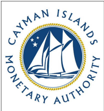
LOCAL FINANCIAL SECTOR SCRUTINY IN THE SPOTLIGHT