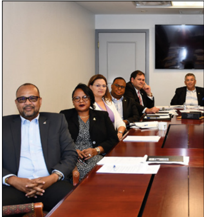
Parliament Management Council Holds First Meeting