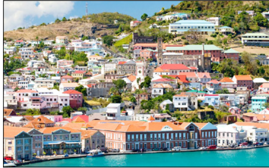
► Grenada is fighting to control its virus spread

Under the present state of emergency there is a midnight to 4am curfew, the mandatory wearing of face masks or face coverings in public, closure of all businesses by 10pm, a maximum of 20 people allowed at weddings and funerals and no social gatherings without permission.