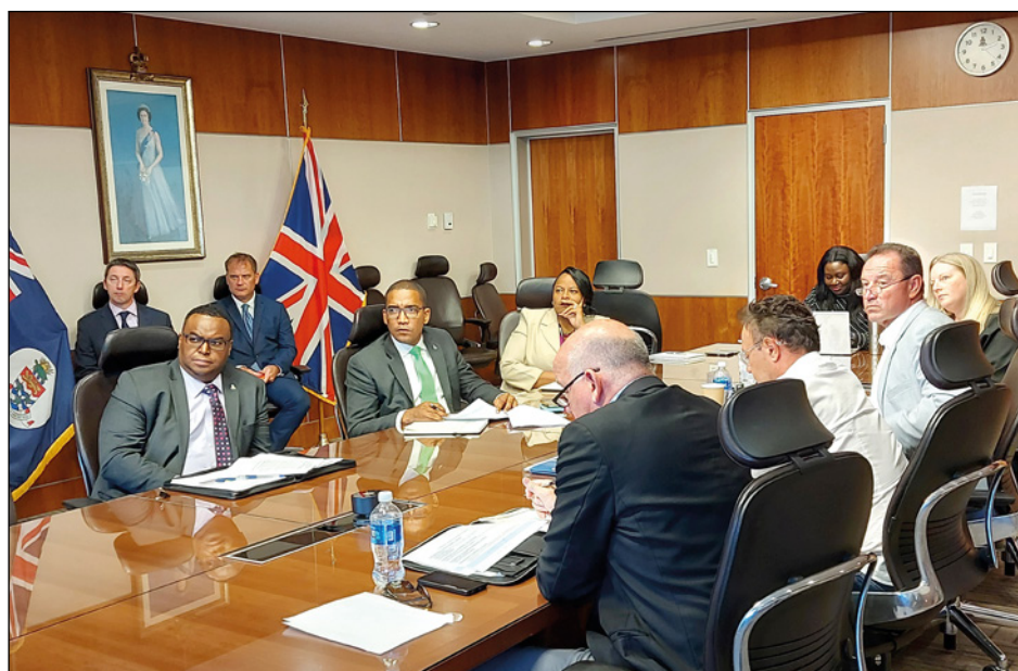
► CITA Meeting with members of Cabinet