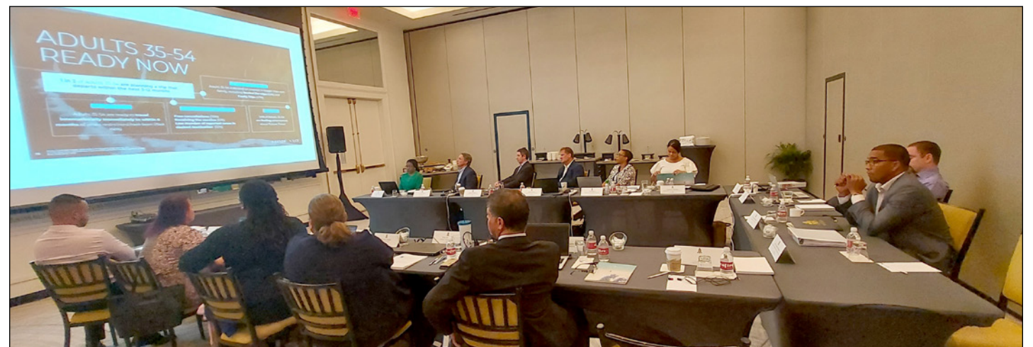
► CIDOT ministerial Briefing with Minister Bryan

"The positive feedback from applicants reinforces that the Cayman Islands remains a much sought-after destination,