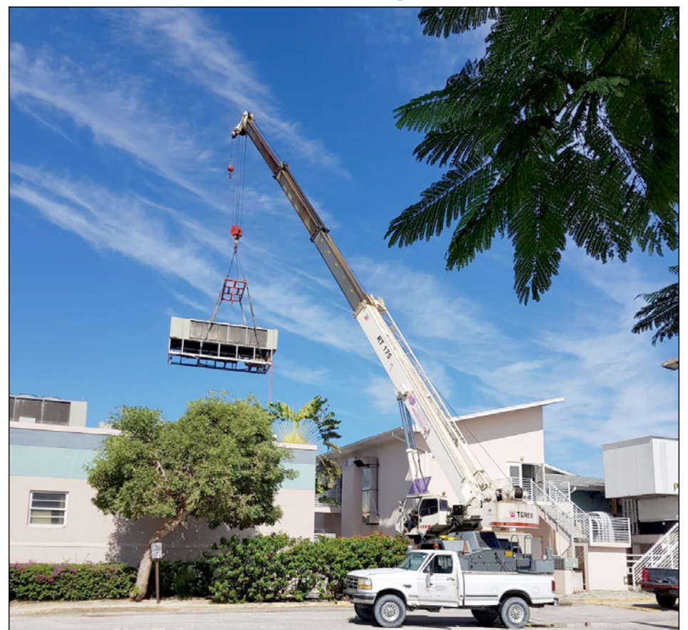
► New chiller replacements at the Cayman Islands Hospital

"Alongside the environmental benefits the works will bring for the HSA, local businesses are also anticipated to benefit in the construction and implementation phase of the project, helping to boost the local economy," Mr Tibbetts added.