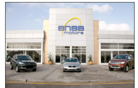
► Trinidad's ANSA McAL Group has evolved superbly

Jamaica's GraceKennedy Limited is a shining example of one company that has diversified into a manufacturer of consumer products. Cave Shepherd and Co. Limited is a retail store partnership started in Barbados in 1906. Today, the company has also diversified its operations