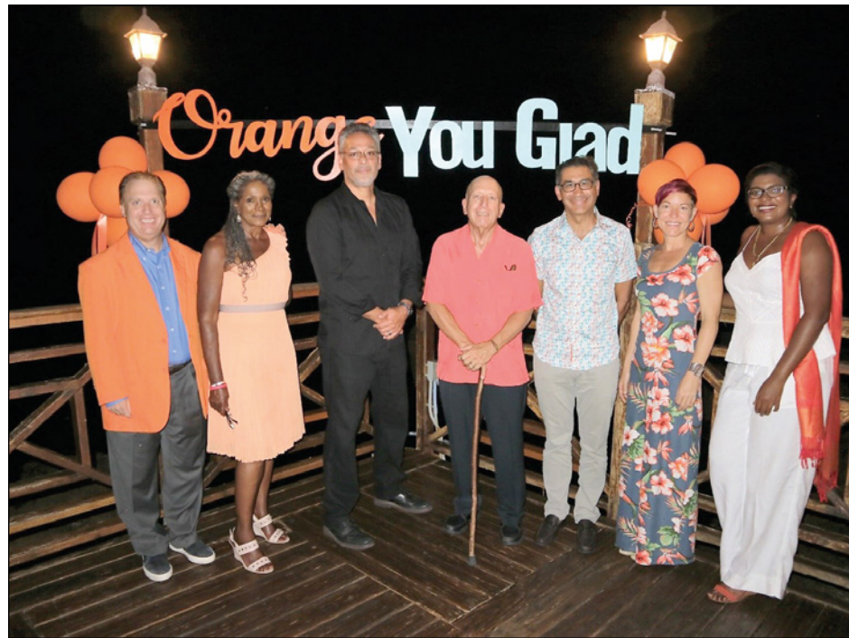
► Meals on Wheels Board of Directors at the 2020 Orange You Glad Dinner

MOW provides daily, hot, nutritious meals & hearty soups to seniors, homebound and disabled persons throughout Grand Cayman. Meals are provided free of cost to the clients and delivered to