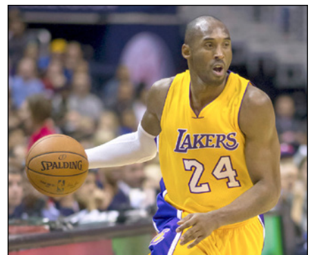
► Kobe Bryant left a huge legacy

Los Angeles Lakers great Bryant retired in 2016; he was the NBA Most Valuable Player in 2008, was Finals MVP twice and earned 18 All-Star selections. He was in the United States team that won Olympic gold in 2008 and 2012.