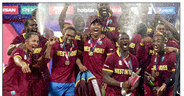
► West Indies play three countries at home this summer

"Following the successful hosting of the all-format series against Sri Lanka earlier this year, we are delighted to announce that we are set to welcome South Africa, Australia and Pakistan to the West Indies," the Englishman said. "To host three international teams back-to-back in five territories is unprecedented, and putting these fixtures together was an enormous, COVID-related logistical challenge.