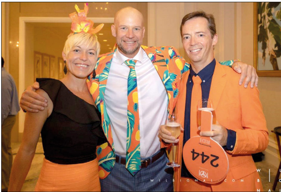
► Guests dress the part and have fun at the live auction