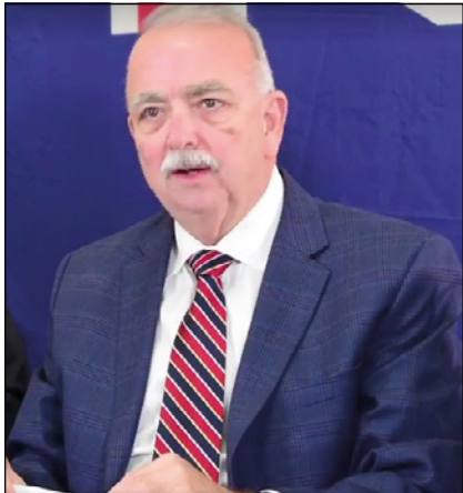
CHALLENGING TIMES AHEAD FOR CAYMAN