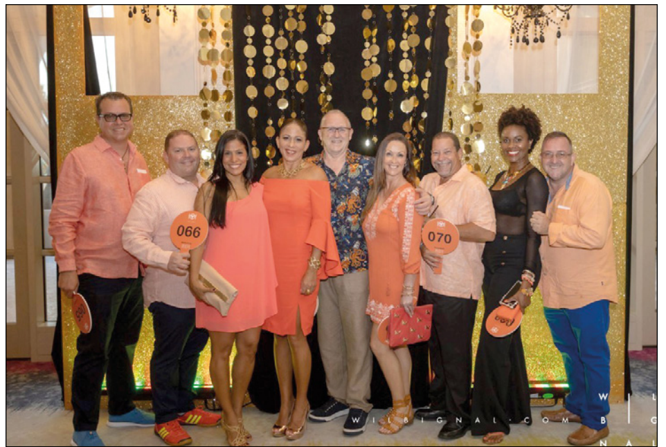
► Friends gather to support the Orange You Glad Gala and have a fun night!