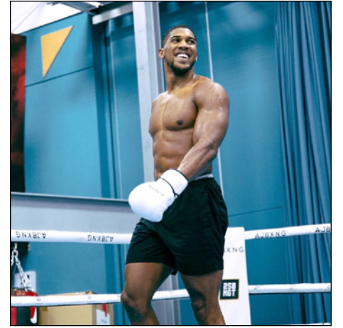
► Anthony Joshua is staying low-key and training hard for the big fight

Mayweather, 44, who dominated the sport for years while compiling a perfect 50-0 record, will showcase his sublime skills against Paul, a YouTube star with