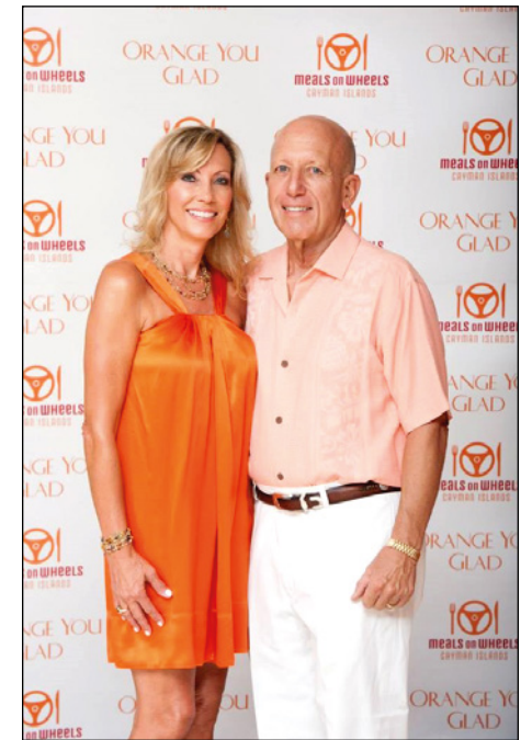
► Guests are encouraged to wear Orange, but it is not required

their homes, 52 weeks per year. Meals are prepared in 4 community kitchens and delivered to over 300 persons each weekday in all 5 districts - referrals continue to be made daily for more seniors in need.