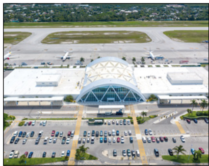
The Panel calls for information blitz