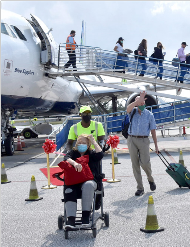
► Returning visitors will be a massive relief for the tourism industry

"They didn't pick just any little island to come to, they wanted to come to the Cayman Islands. I know the pandemic safety concern, it's something that we have to pay close attention to. But that energy, that love, that commitment to our country, we have to continue to foster it, because it's what built our country along with the financial services industry. These are the first baby steps, but we are going to grow so fast and I hope to be speeding by the middle of next year."