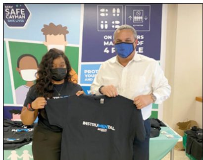
Deputy Governor's message on International Men's Day