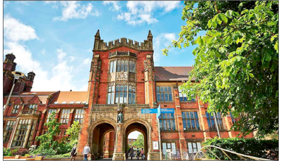
► Caymanians will have the chance to study at some of the UK's most prestigious universities like Newcastle University