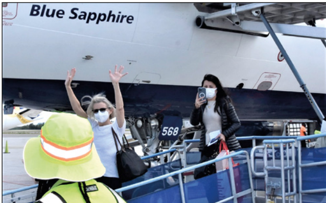
► Cayman welcomes visitors again

That said, this very gentle phased approach does mean Cayman has some time to get things absolutely right when it comes to the treatment of visitors to these shores. This is something that no other country in the world has achieved, with damaging and deadly rises in community spread following border opening