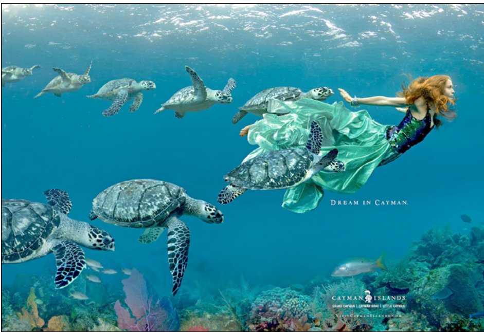
► An award winning Dream in Cayman advertisement