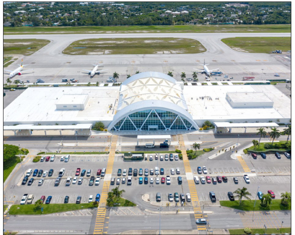
► Information blitz required as visitors once again arrive at Owen Roberts International Airport

There's also strong encouragement for residents to spend their money at home and keep it circulating within the local economy rather than spending it abroad even by travelling or online external shopping.