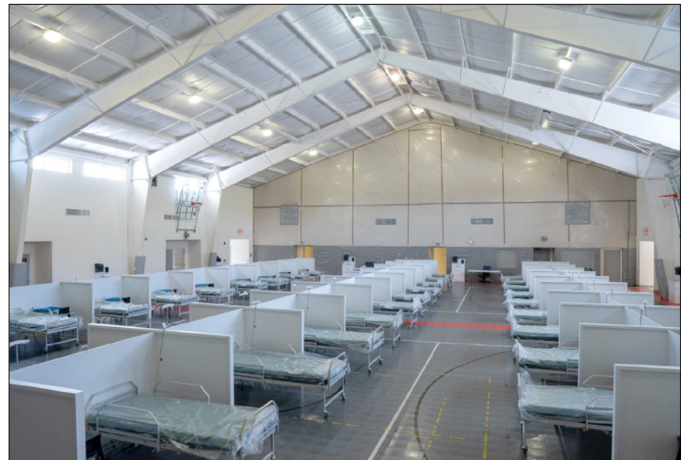
► The Field Hospital at the Family Life Centre will be remobilised

"The HSA is working to recruit individuals to be able to staff the field hospital. These individuals are being sourced