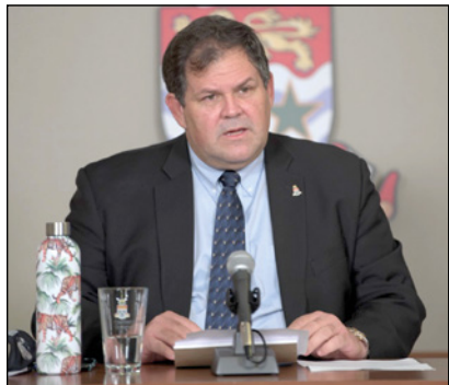
Government brings back ticketable offences