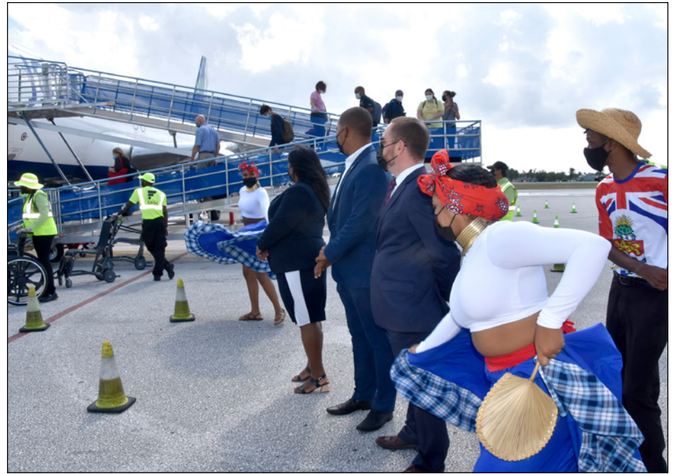
► The Dream Chasers dancers helped make the travellers feel welcome