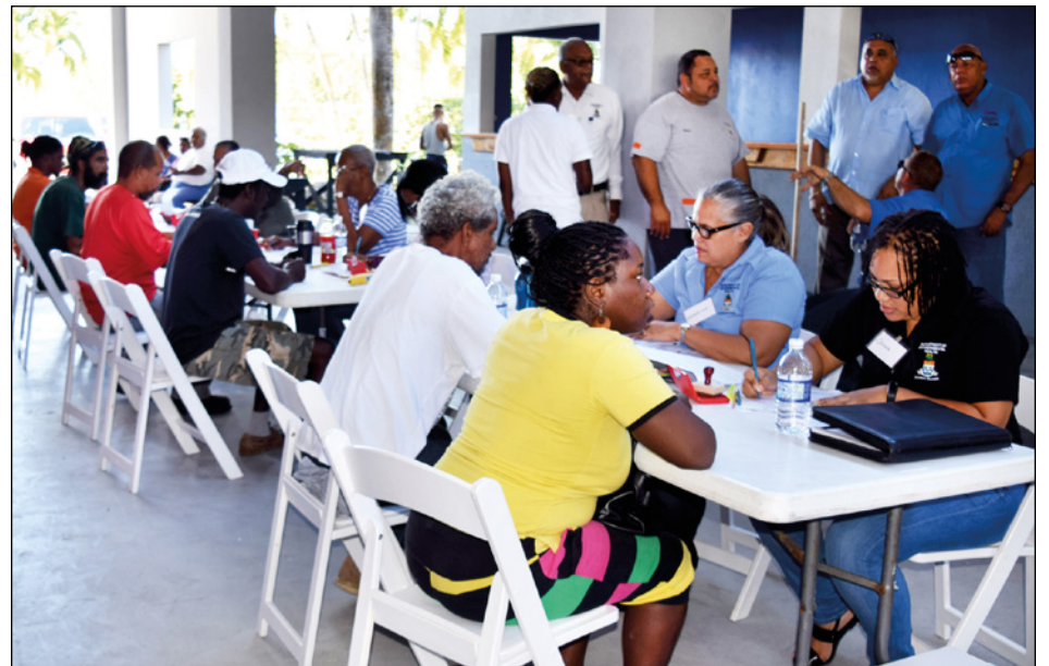
► NiCE programme reopens

Registration details for selected participants will be available at a later date.