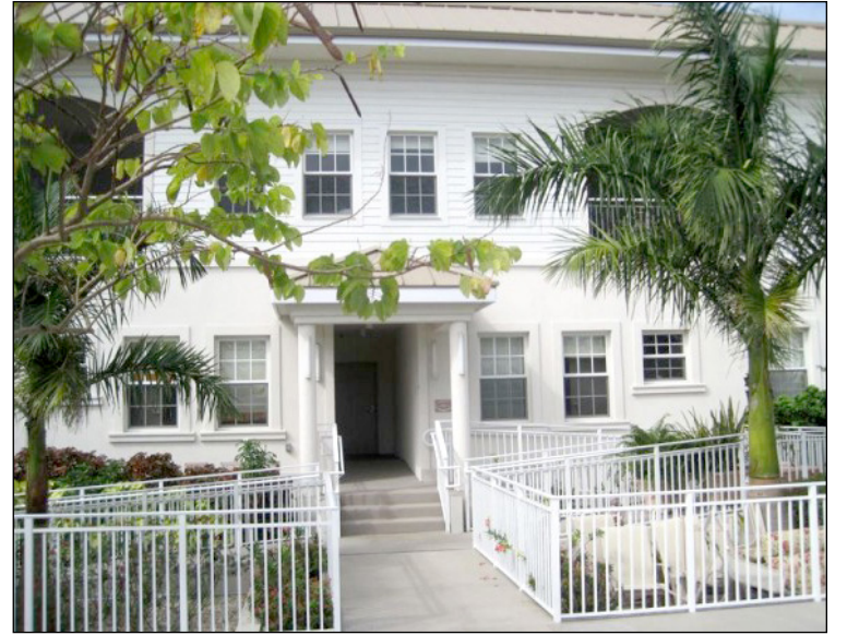
► Pines Retirement Home

She said: "Nearly two years into the Covid-19 pandemic, widespread vaccination has provided our crucial first line of defence and offers vital protection for our whole community. Given