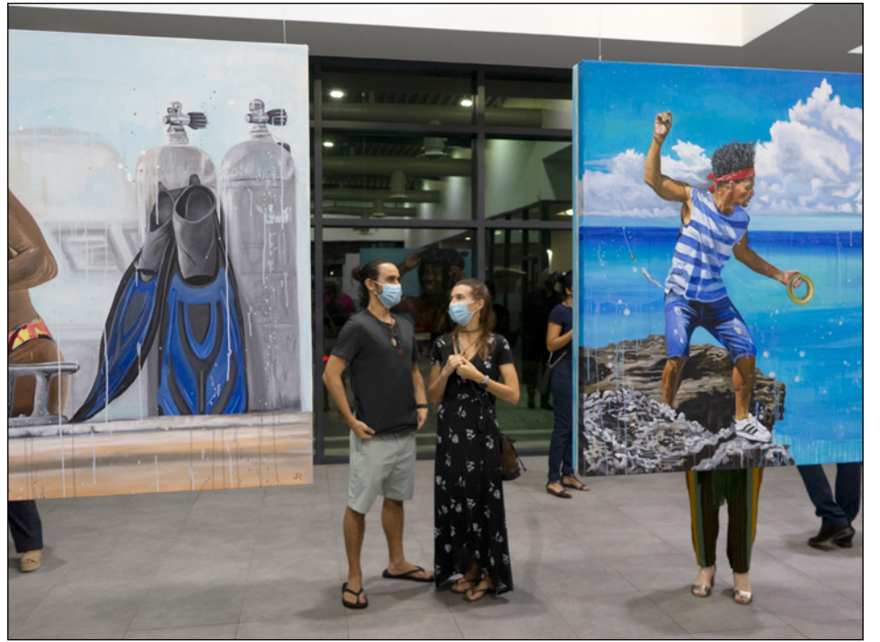
► A magnificent exhibition