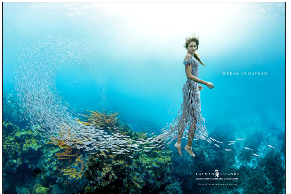
► Dream in Cayman advertisements are getting a revamp