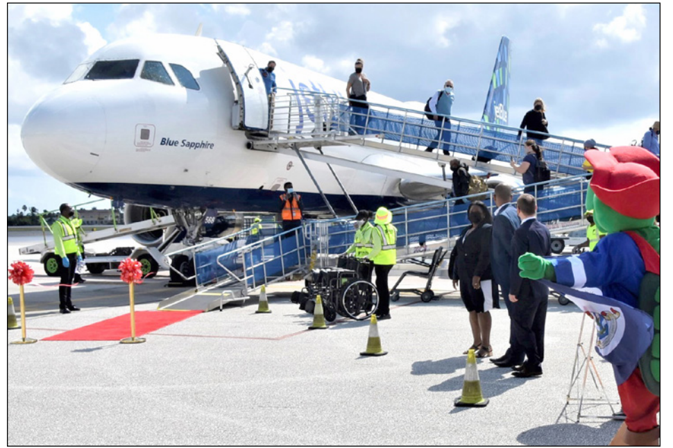
► Open again! Cayman celebrates at ORIA