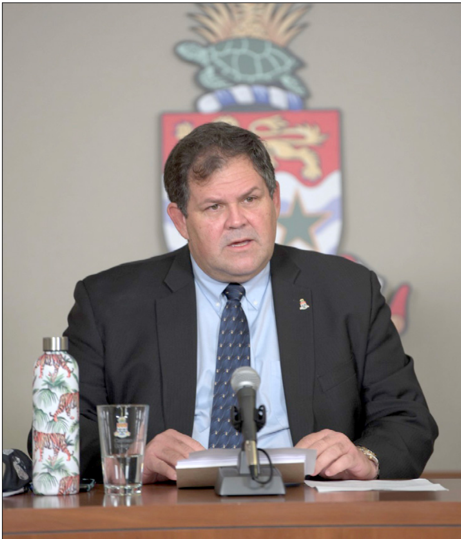
► Premier Wayne Panton