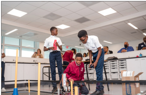
► Members of the JGHS Robotics Team demonstrate their skill for visitors to the robotics area.