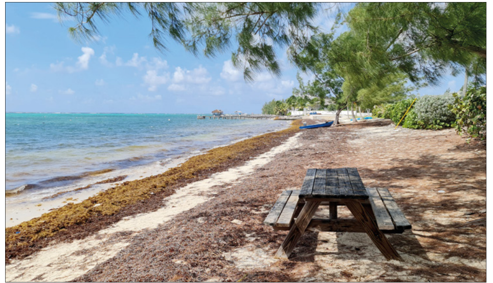
► Sargassum season starts in South Sound