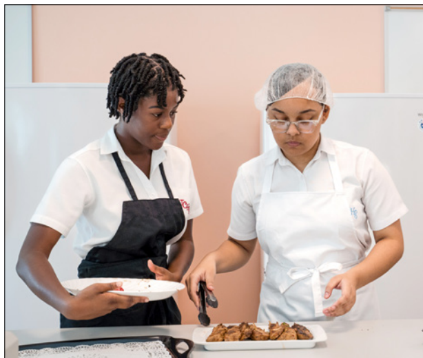
► Food & Nutrition students prepare to serve guests arriving in the Foods Lab.