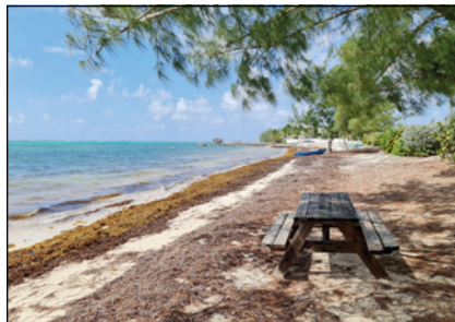
CAYMAN COPES WITH THE SARGASSUM SCOURGE