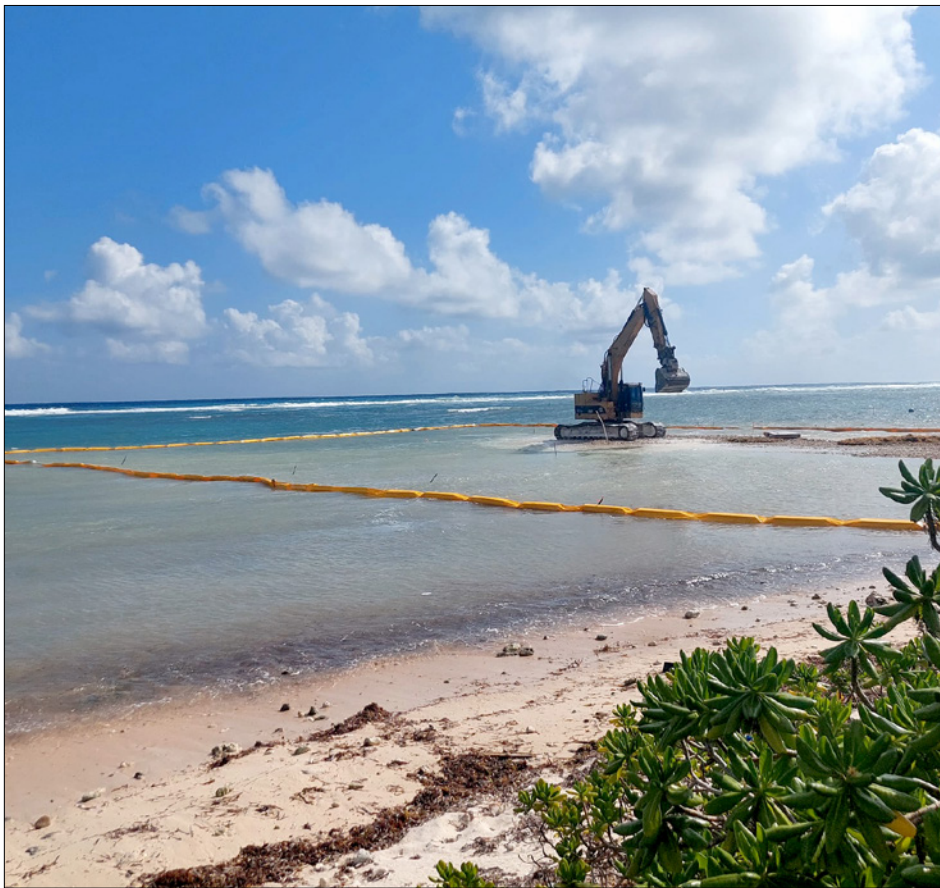
► Commencement of piling work for the new dock this week.

partment, include dredging works at the existing dock and the new dock location as well as construction of a new dock and repairs to the existing fish hut.