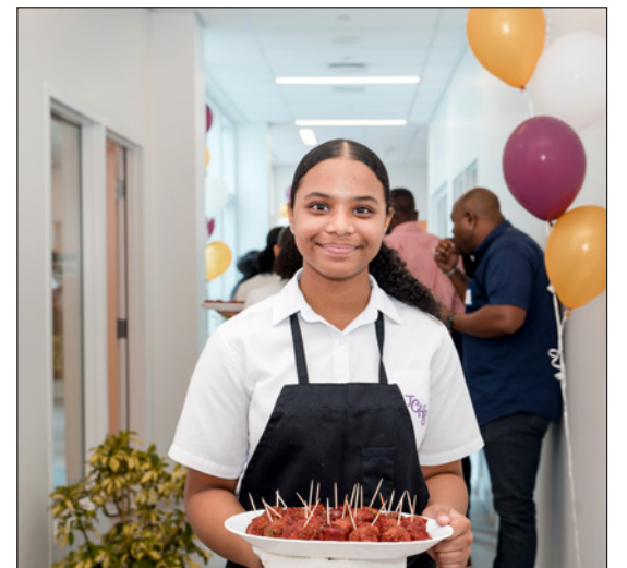
► A Food & Nutrition student serves guests during a tour of the Foods Lab.