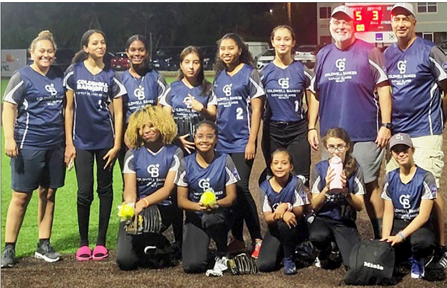
► Coldwell Banker - March 25th