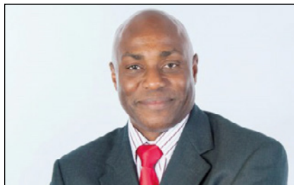
Caymanian Times celebrates 10 years. Launches New talk show