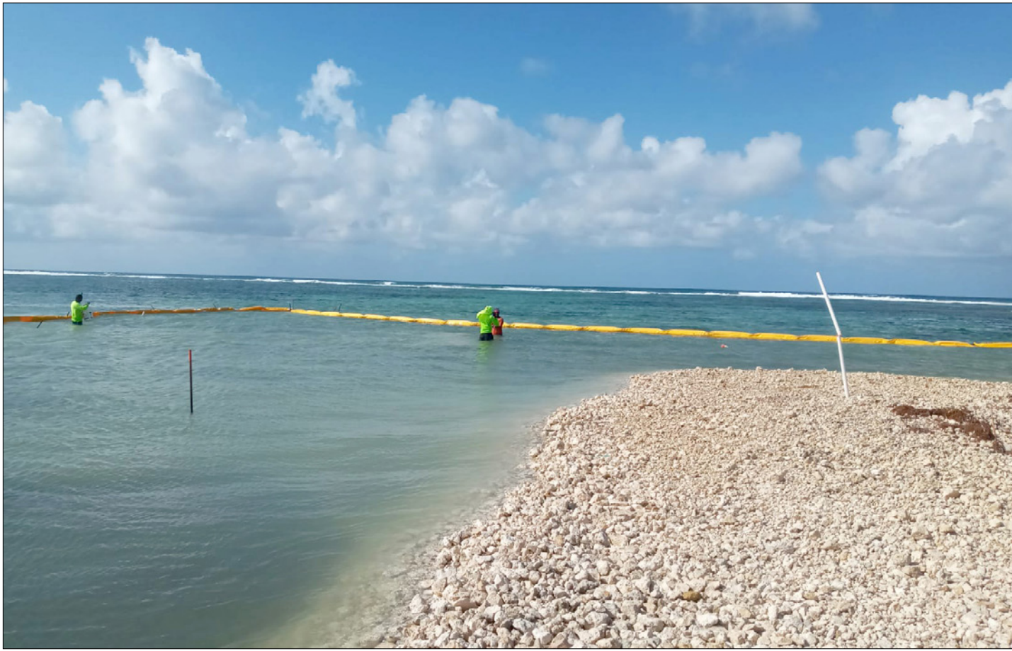
► Installation of silt screen prior to commencement of dredging.