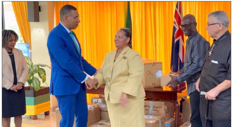
► Prime Minister for Jamaica Hon. Andrew Holness greets Premier Juliana O'Connor-Connolly