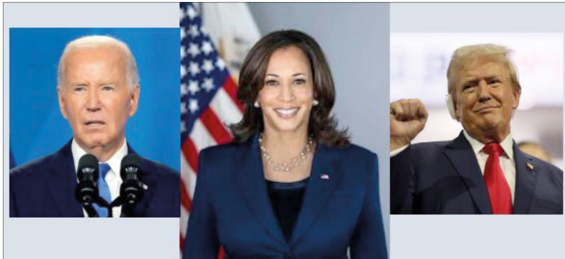
► Biden Harris Trump

That will be just short of a month after the Republican party held its convention in which it gave the thumbs-up to former President Donald Trump and his choice for running mate, J D Vance.