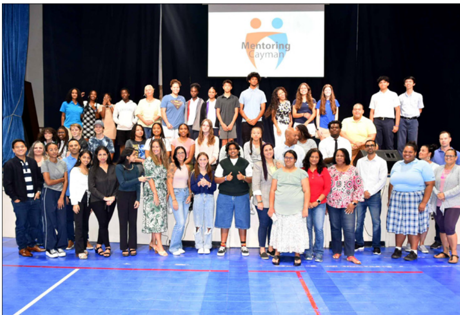
► Group shot of Mentees

Are you seeking a rewarding opportunity to make a meaningful impact on a student's life? Mentoring Cayman, a programme begun 20 years ago by the Cay-