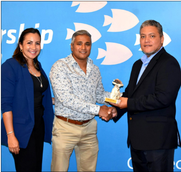
► A big thank-you, and a special presentation, to Wheaton Precious Metals for their continued sponsorship of the programme.