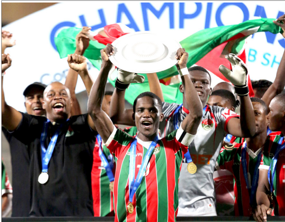
► SV Robinhood Club Shield 2023

In addition to the defending champs SV Robinhood, the contenders are: America FC (Haiti); Arnett Gardens FC (Jamaica); AS Étoile De Matoury (French Guiana); AS Junior Stars (Sint Martin); B.A.Y.S FC (St. Lucia); CCCUL Dublanc FC (Dominica); Club Atlético Pantoja (Dominican Republic); CRKSV Jong Holland (Curaçao); Defence Force FC (Trinidad and Tobago); Grenades FC (Antigua and Barbuda); Guyana