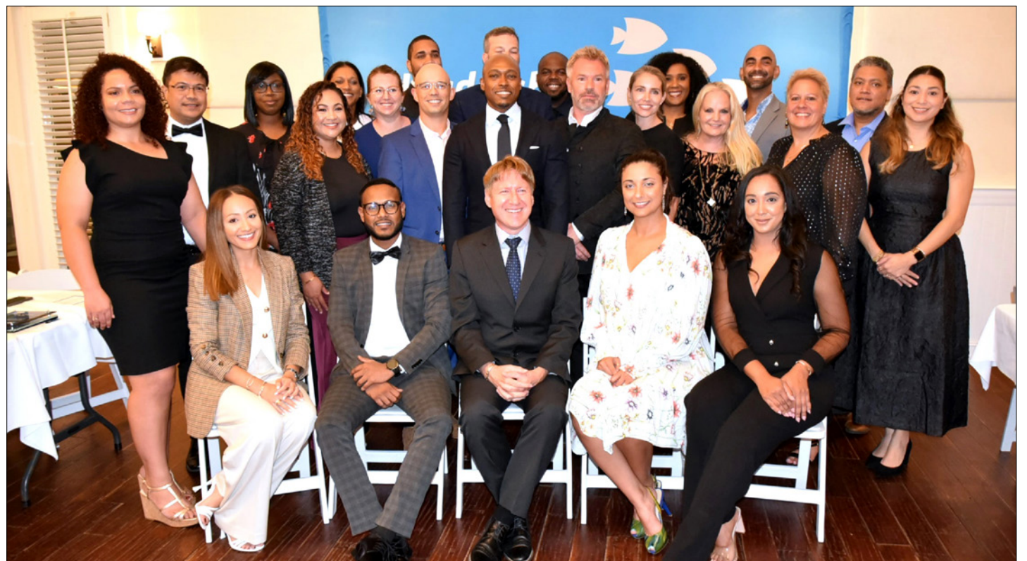
► Leadership Cayman's Class of 2024 group shot