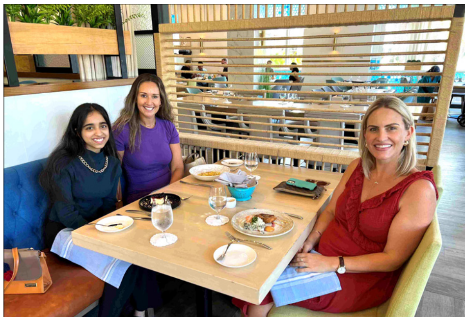
► Mentor and Mentees

man Islands Chamber of Commerce, is now accepting applications for the 2024/25 school year. It can make a big difference in the lives of the mentees, as well as those