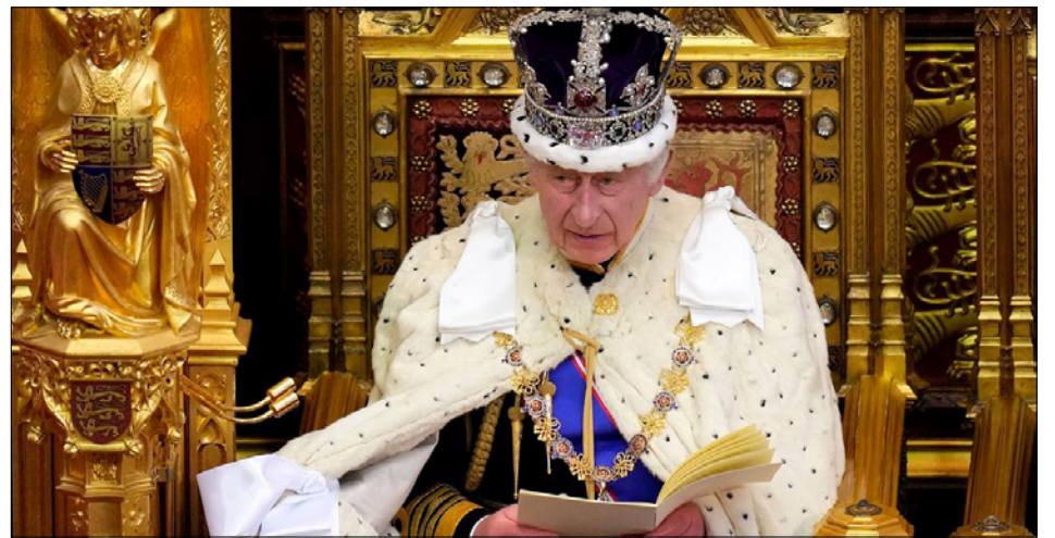
► UK Kings Speech 2024

The new government's policy priorities outlined in the King's Speech focus on what it termed as "creating wealth in every corner of the country, and improving the living standards of working people."