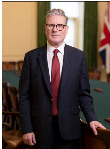
► Prime Minister Sir Keir Starmer Official

While not a feature of the Labour Party manifesto, the Public Access Beneficial