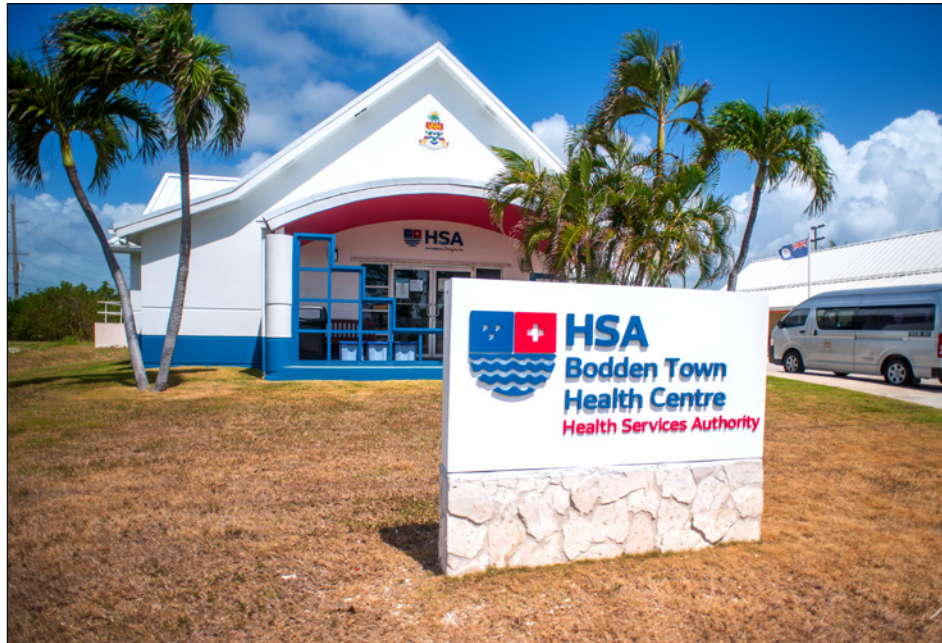
► Bodden Town Health Centre

"At the HSA, we continue to ensure that the population remains healthy and safe by providing care in multiple convenient settings. Our vision is to strategically utilise resources to facilitate care for members of the community. By accessing care closer to home it benefits the patients and lessens the time and