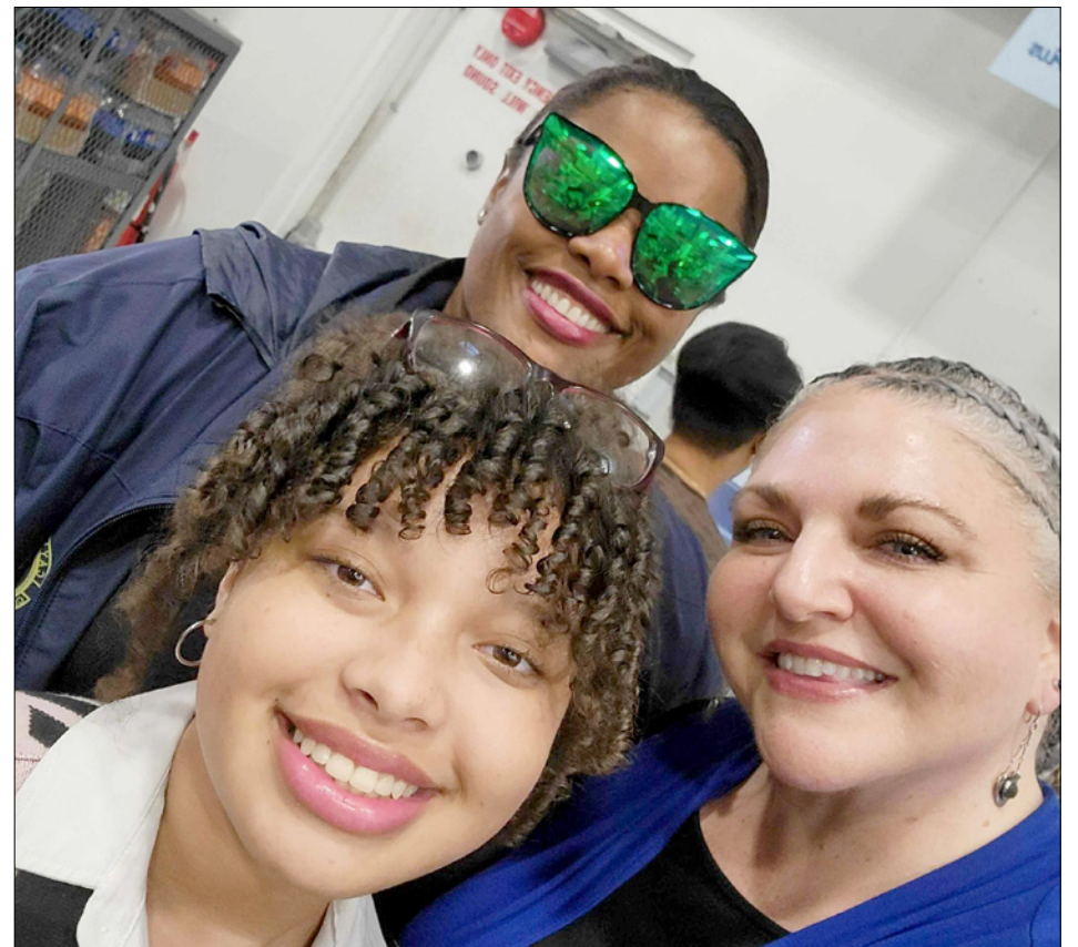
► Mentoring Cayman

To learn more about Mentoring Cayman and how you can make a difference, contact swan.sandoval@caymanchamber.ky or call 743-9124 or visit www.caymanchamber.ky