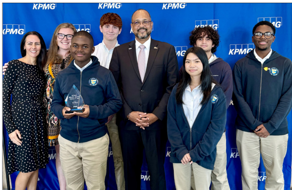
► Winners Cayman Prep with Hon. Isaac Rankine, The Minister of Youth, Sport & Heritage