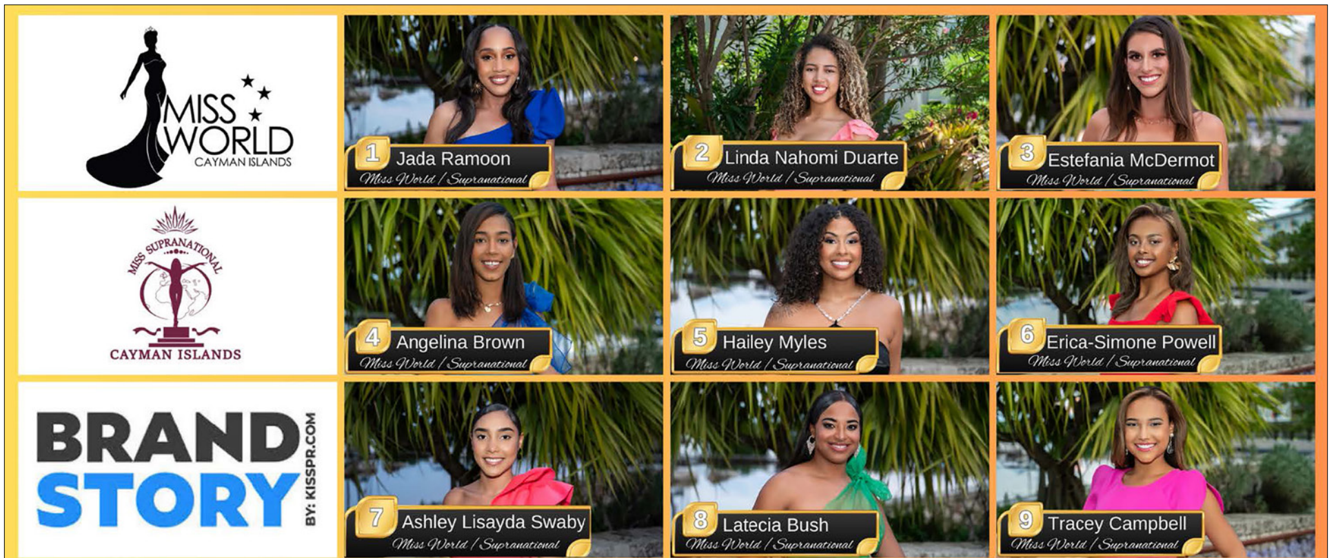
► Miss World and Miss Supranational Contestants