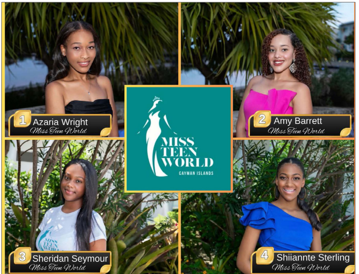
► Miss Teen World Contestants