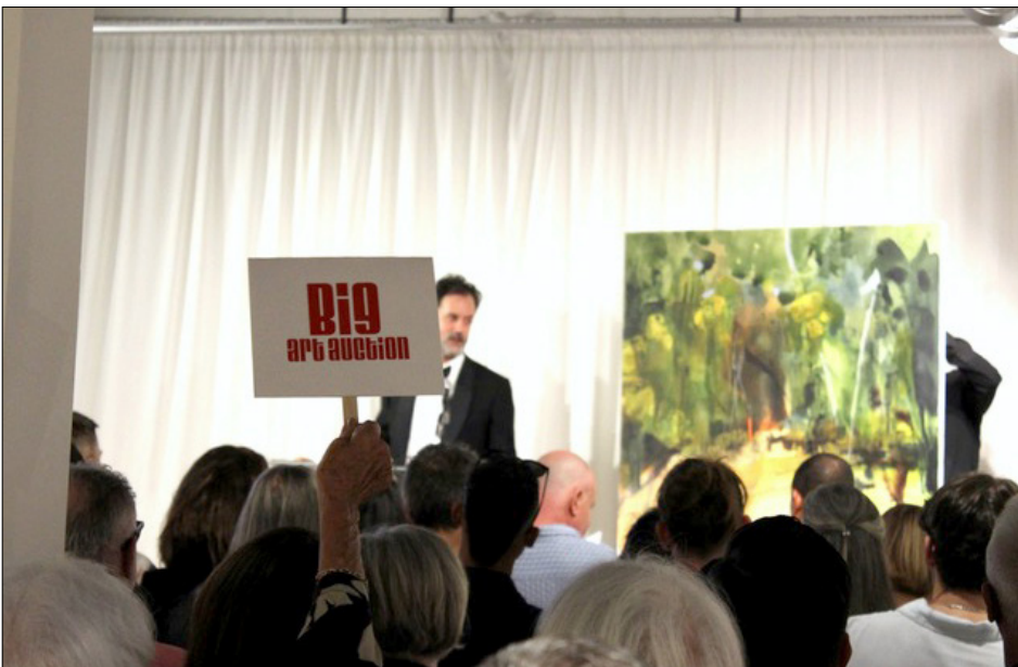
► The Big Art Auction bidding

Thirty local artists participated in this year's Big Art Auction for the National Gallery of the Cayman Islands, donating 50% of proceeds from sales to the National Gallery. The funds raised will support the development of the Gallery's Permanent Collection and collection-based education programmes and school tours.