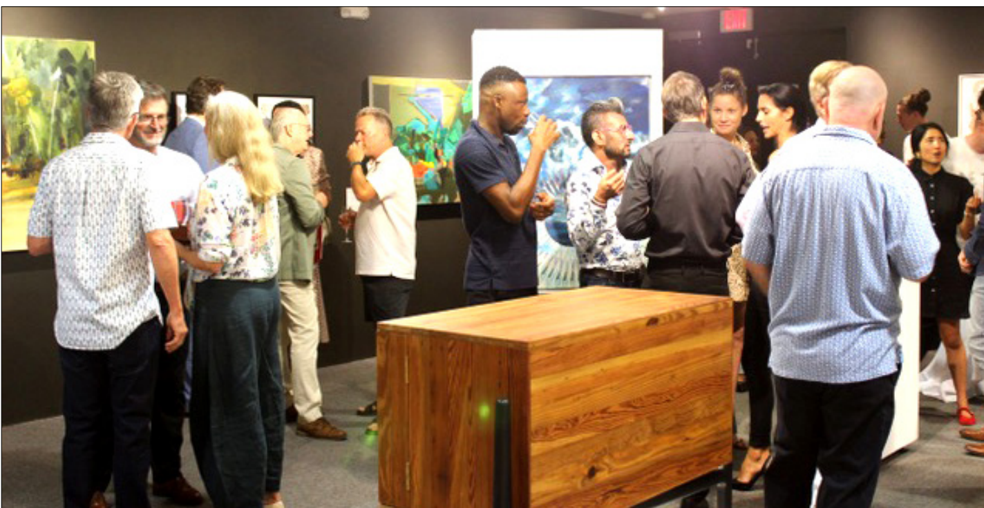
► The Big Art Auction exhibition

For more information about current and upcoming events at the National Gallery, visit https://www.nationalgallery.org.ky/