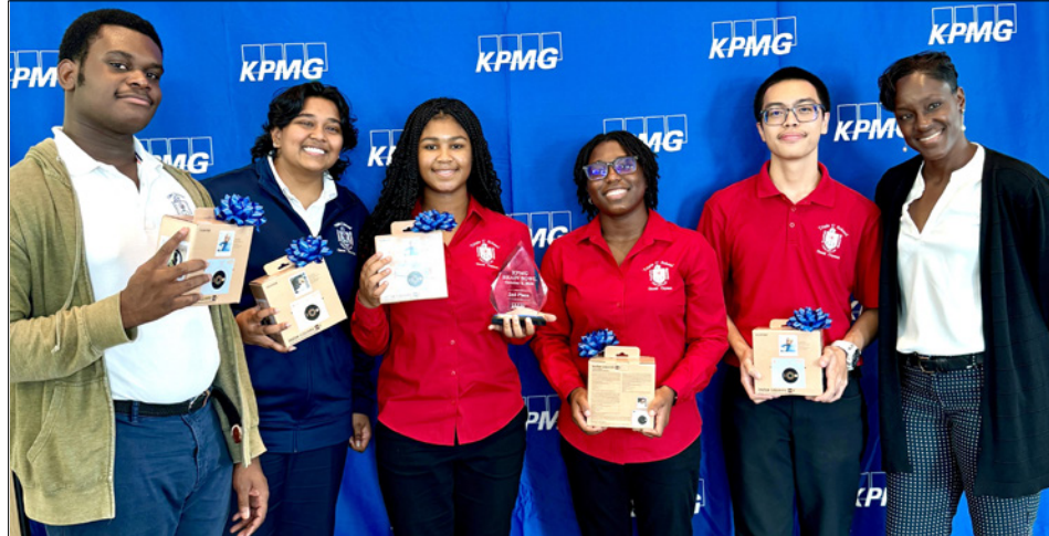
► Second Place - Triple C

to come and support the students' performance in the afternoon to watch the final rounds. The event was also available to live stream via the KPMG in the Cayman Islands YouTube Channel, providing an opportunity for family and friends to cheer on the teams throughout the day.