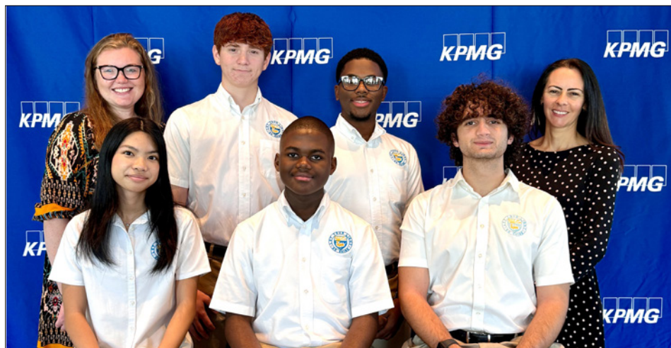
► The Winning Team - Cayman Prep

KPMG hosted the 11th Annual KPMG Brain Bowl Academic Tournament today, Wednesday, October 9, 2024 at the Hotel Indigo Grand Cayman.