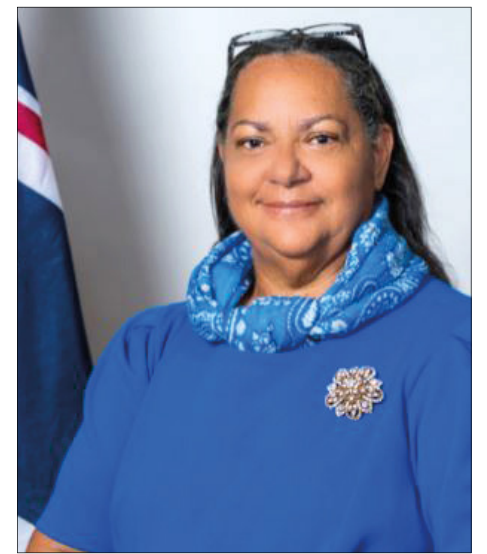
► Premier Hon. Julianna O'Connor-Connolly

"In addition to the 5% COLA adjustment, in the coming months, the Government, along with senior leadership in the Civil Service, will be reviewing additional pay strategies to address the salaries of those civil servants on the three lowest pay grades, namely grades R, Q and P. The aim of this future project is to uplift those pay grades so that the minimum pay any civil servant can receive is $3,000 per month," she said, adding that a further announcement would follow once the review had been completed.