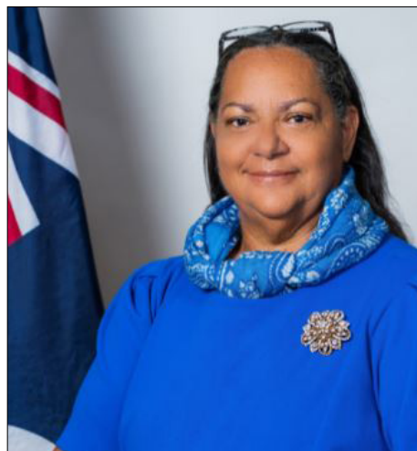
► Premier Hon. Julianna O'Connor-Conolly

Introducing legitimate interest protocols recognises that access to beneficial ownership information now extends beyond law enforcement to certain members of the public, based on the 2022 EU Court judgment ( Sovim v Luxembourg ). This judgment balances transparency with privacy rights, by requiring access to beneficial ownership information only where there is a "legitimate interest". The