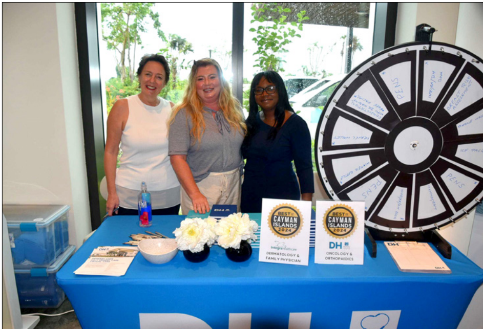
► Event sponsors Doctor's Hospital