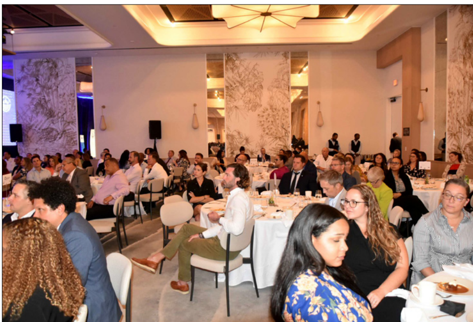
► Guests at the Parliamentary Luncheon