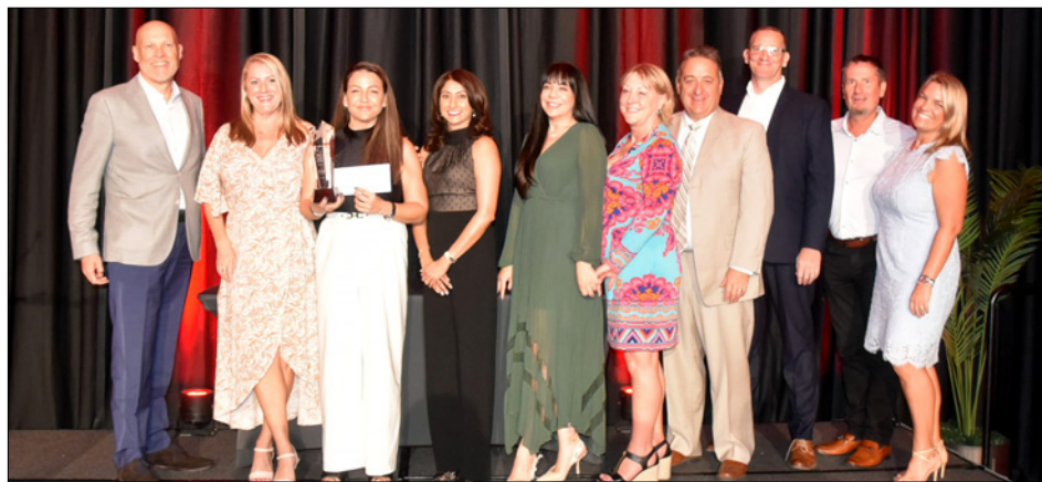
► The Award for the Real Estate Company of the Year went to Williams2