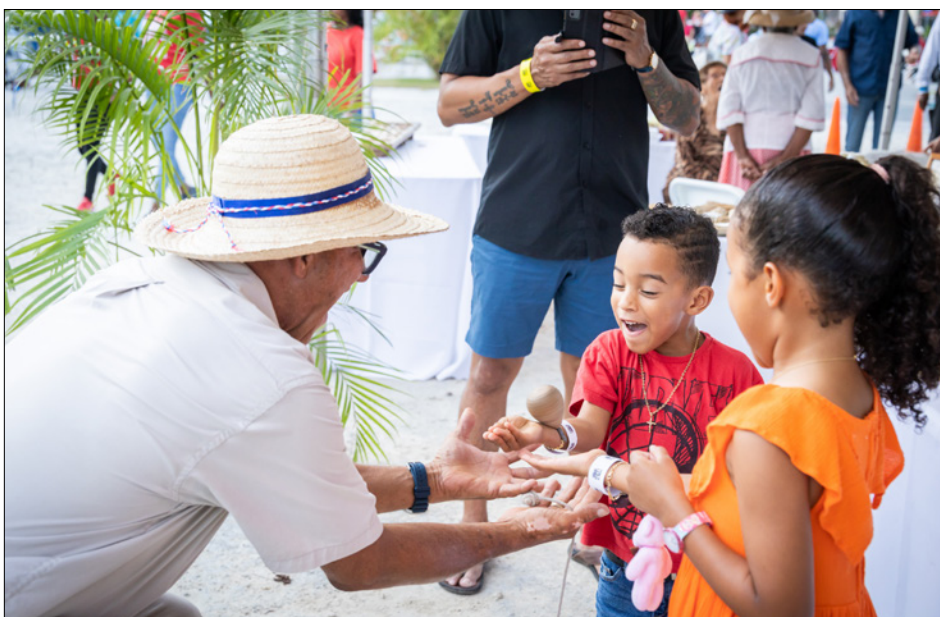
► Cayman National Cultural Foundation will continue to host a busy calendar of events at the FJ Harquail Centre such as the popular Red Sky at Night festival.

As it celebrates 40 years as a leading arts organisation, the Cayman National Cultural Foundation is expanding its areas of focus from producing theatre, festivals and events in-house to developing new creative partnerships, growing education and cultural resources, and broadening for support for creatives working in the Cayman Islands.