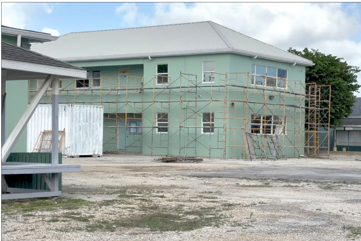
► Exterior painting at the old George Hicks campus.

The Ministry of Education (MOE) and Department of Education Services (DES) today announced that the Cayman Islands Further Education Centre (CIFEC) will continue operations from the Family Life Centre for the remainder of the school term, with plans to relocate to the site previously referred to as the George Hick