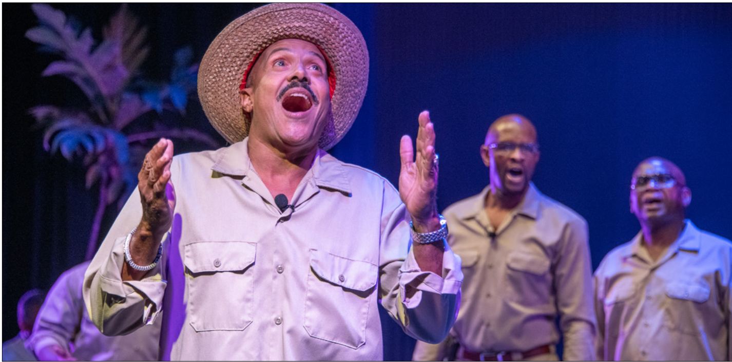
► The Cayman National Choir and Orchestra are the first resident company at the FJ Harquail Cultural Centre.