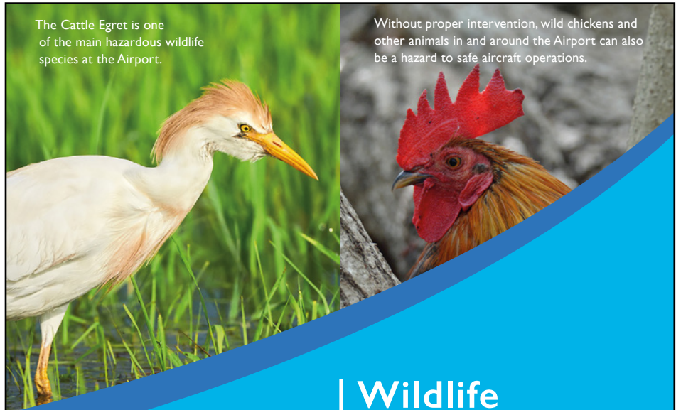
The Cattle Egret is one of the main hazardous wildlife species at the Airport.

Under Section 63 of the Animals Law (2015 Revision) the Department of Agriculture will offer this animal for sale by Public Auction, at the Cl Agricultural Society, Lower Valley, on THURSDAY, DECEMBER 5, 2024 at 10:00AM.