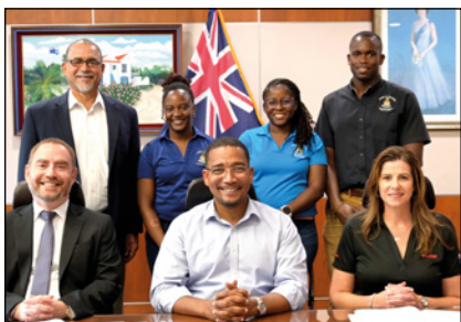
Contract Signed for Phase 2 of Central Scranton Park