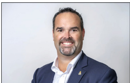
STRATEGIC INTERVENTIONS ON SPOTTS STRAIGHT