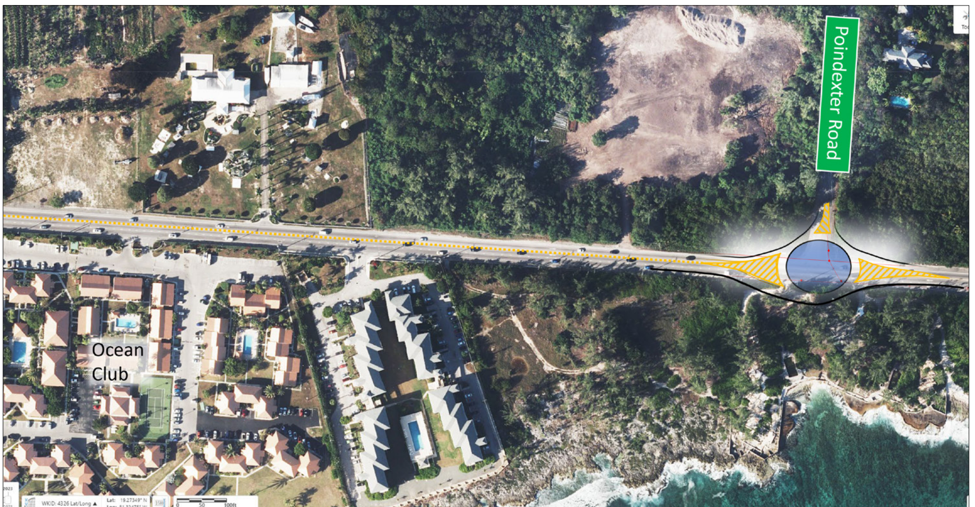
► Poindexter Road - Shamrock Rd Traffic Calming Roundabout