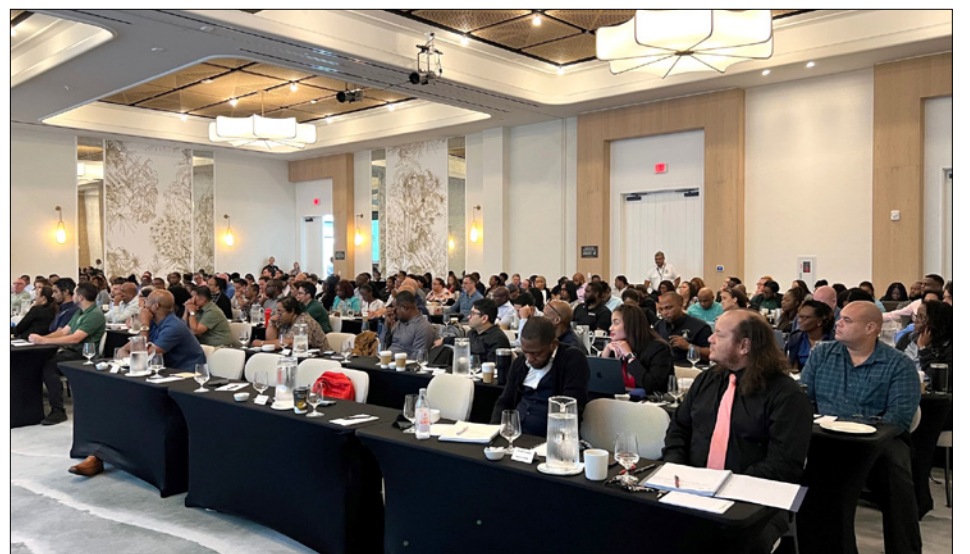
► The workshop, held at Hotel Indigo, was well-attended with over 200 public servants from government ministries and statutory authorities participating.