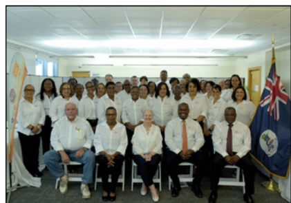
Governor Issues Writs for the 2025 General Election