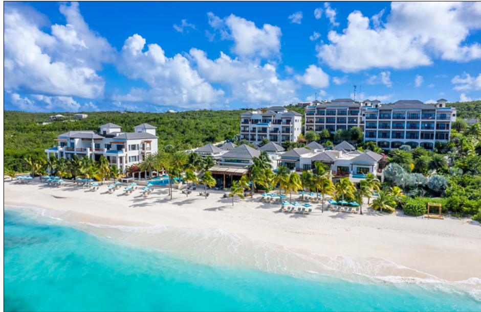
► Zemi Beach House Hotel

"Anguilla continues to strengthen its proposition as a destination of choice for discerning luxury travellers, achieving re-