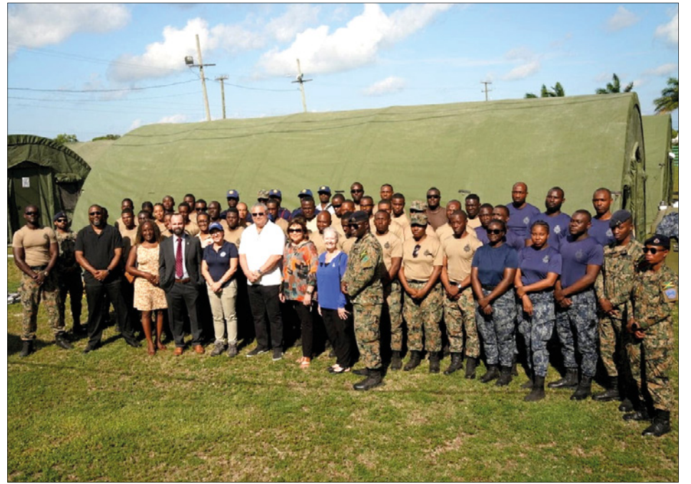
► Cayman Islands senior leaders stand with officers from the Jamaica Defence Force.