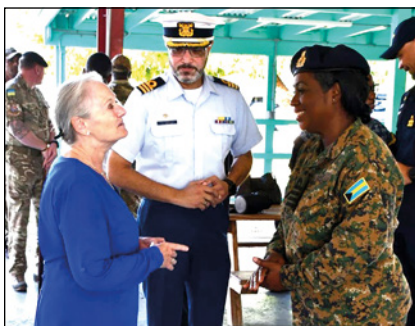
Governor Welcomes Exercise Event Horizon 2025 Participants