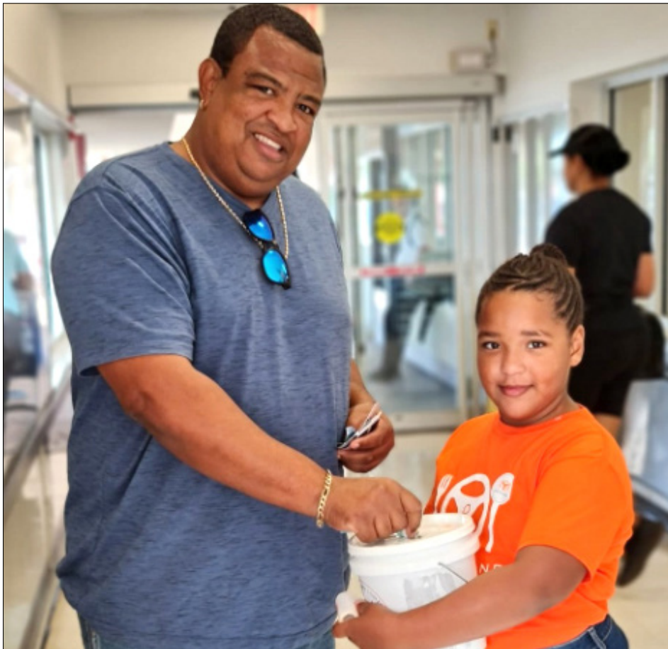
► Volunteers of all ages came out to support MOW Change for Change 2024

Meals on Wheels is excited to announce the return of its Change for Change Donation Drive, taking place on Friday, 31 January and Saturday, 1 February 2025.