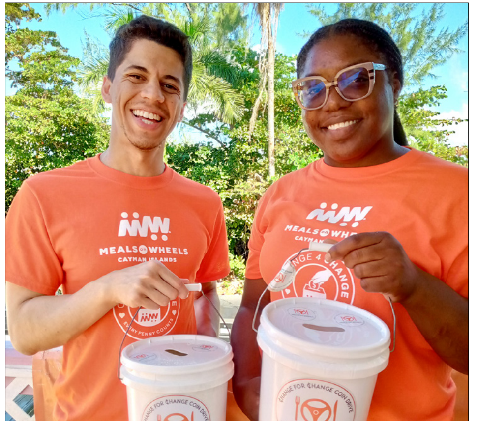
► Volunteers proudly assist MOW Cayman during the Change For Change Donation Drive