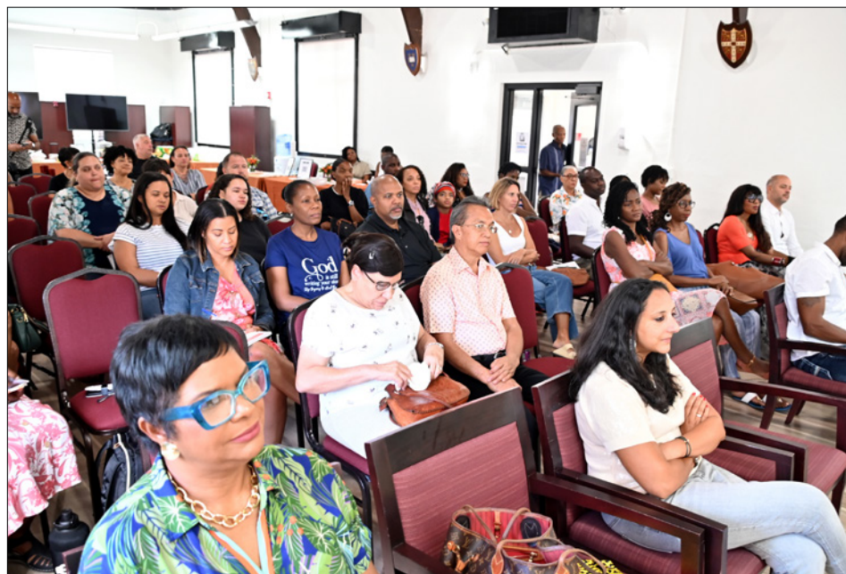
► The Historic Library at George Town was filled with guests for the book-signing