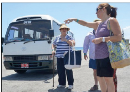
Flashback - July 2015: 'Another Reason for a Cruise Port'