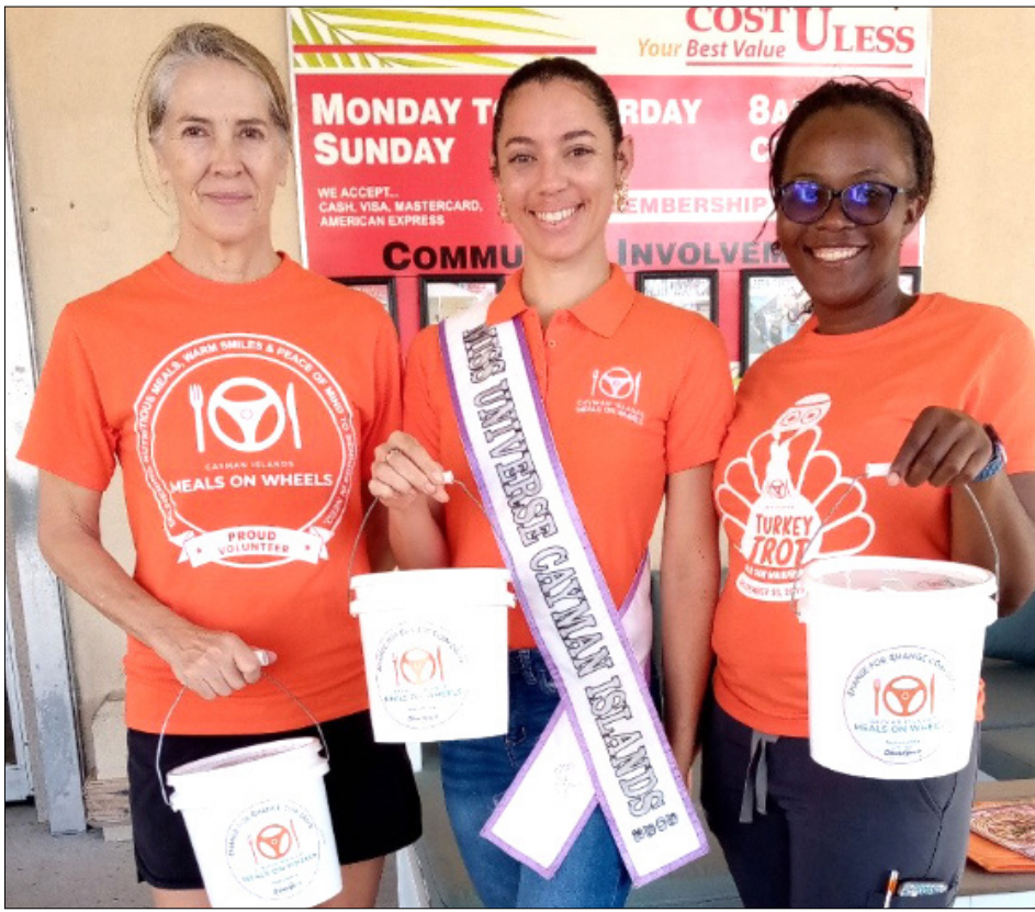
► Former Miss Universe Cayman Islands Illeann Powery lends a helping hand during last year's Change For Change Donation Drive