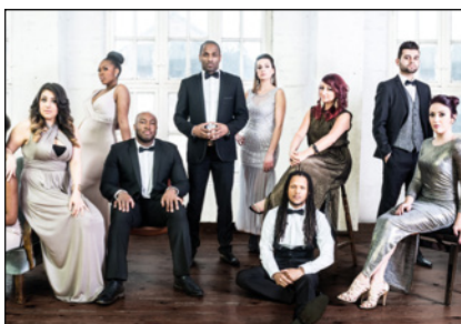
Cayman Arts Festival to feature more genres and local talent