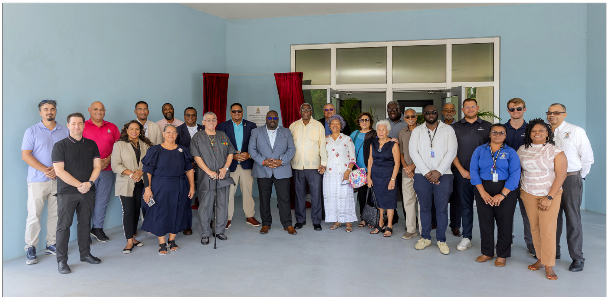
► It was all smiles after the official handing over of the Bodden Town Church of God Multi-Purpose Hall was completed on Thursday, 16 January, 2025.