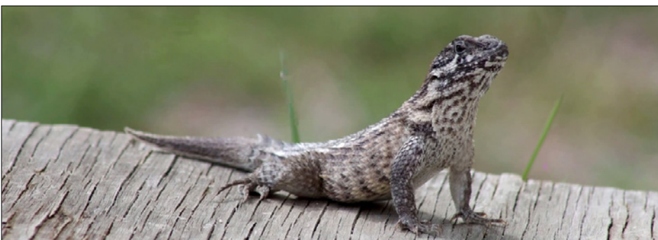
► Curly-Tailed Lizard (native)

A previously untouched haven for native species and virgin habitat, Little Cayman has been exploring the potential benefits of invasive species controls for nearly two decades. As steep declines in annual populations of the Sister Islands Rock Iguana – found only in the Sister Islands and nowhere else in the world – were consistently recorded, cameras placed out in the wild, along with iguana remains showed clear evidence of cat predation, particularly on hatchling, young, and sub-adult segments of the population. In response, a partnership was formed between the Department of Environment, the Royal Society for the Protection of Birds (RSPB) and the National Trust for the Cayman Islands, supported by UK Darwin Plus funding, with a mandate to control feral cat populations living in the wild, promote responsible pet ownership among the community and develop biosecurity protocols with local stakeholders to help secure the sister islands from invasive species arriving undetected in cargo.