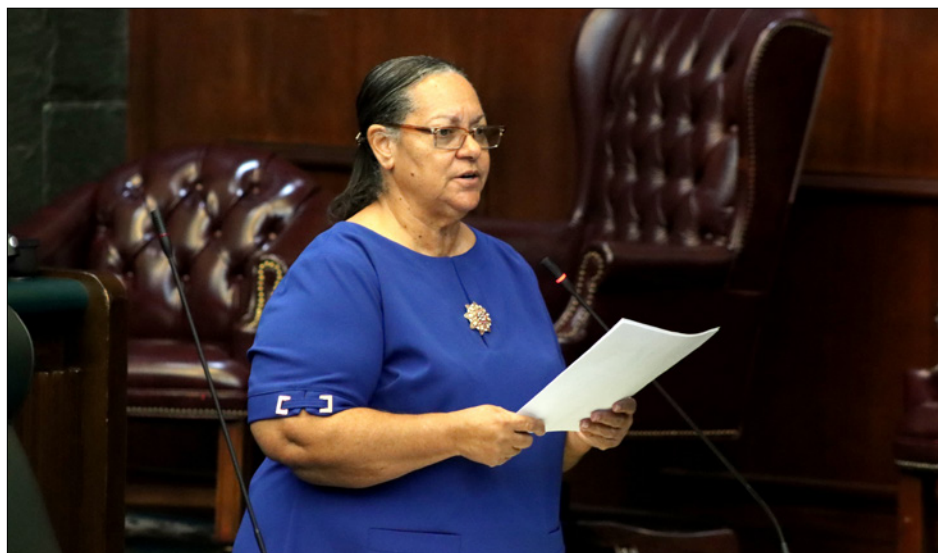
► Parliament - Hon Juliana O'Connor-Connolly