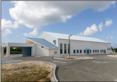
CIG and Bodden Town Church of God Celebrate New Multi-Purpose Hall and Hurricane Shelter