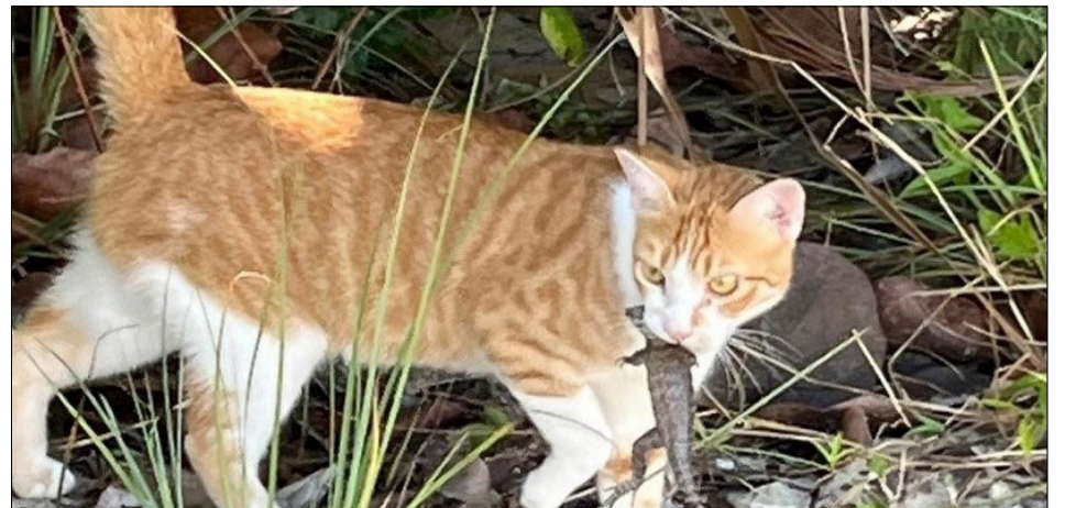
► Roaming cat with young Sister Islands Rock Iguana