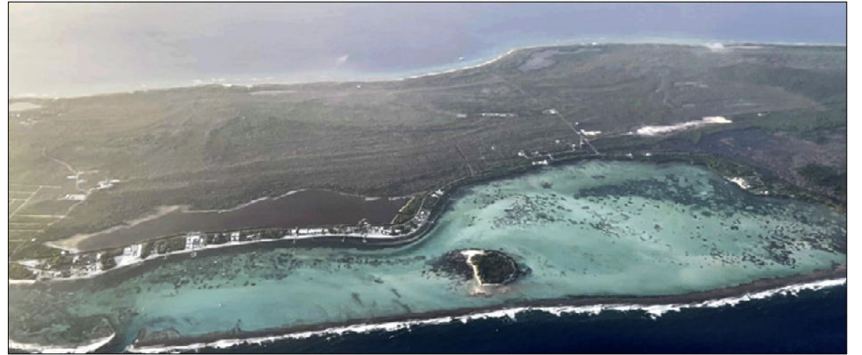
► Little Cayman's delicate ecosystems range from remote dry forests to brackish wetlands and coastal sand beaches