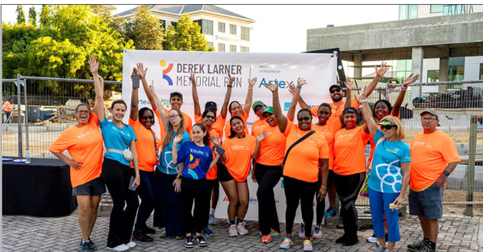
► Volunteers and staff

To stay updated on future events, follow the Derek Larner Memorial Run on Facebook, Instagram, and LinkedIn at @dereklarnermemorialrun.