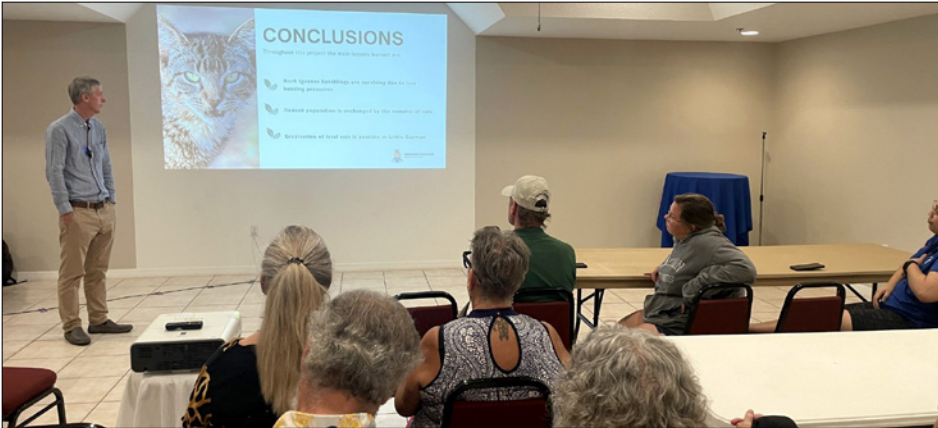
► Residents attended a public meeting at the Little Cayman Beach resort in November 2024