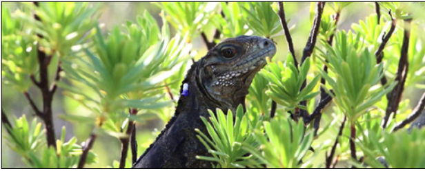
► Sister Islands Rock Iguana (endemic)