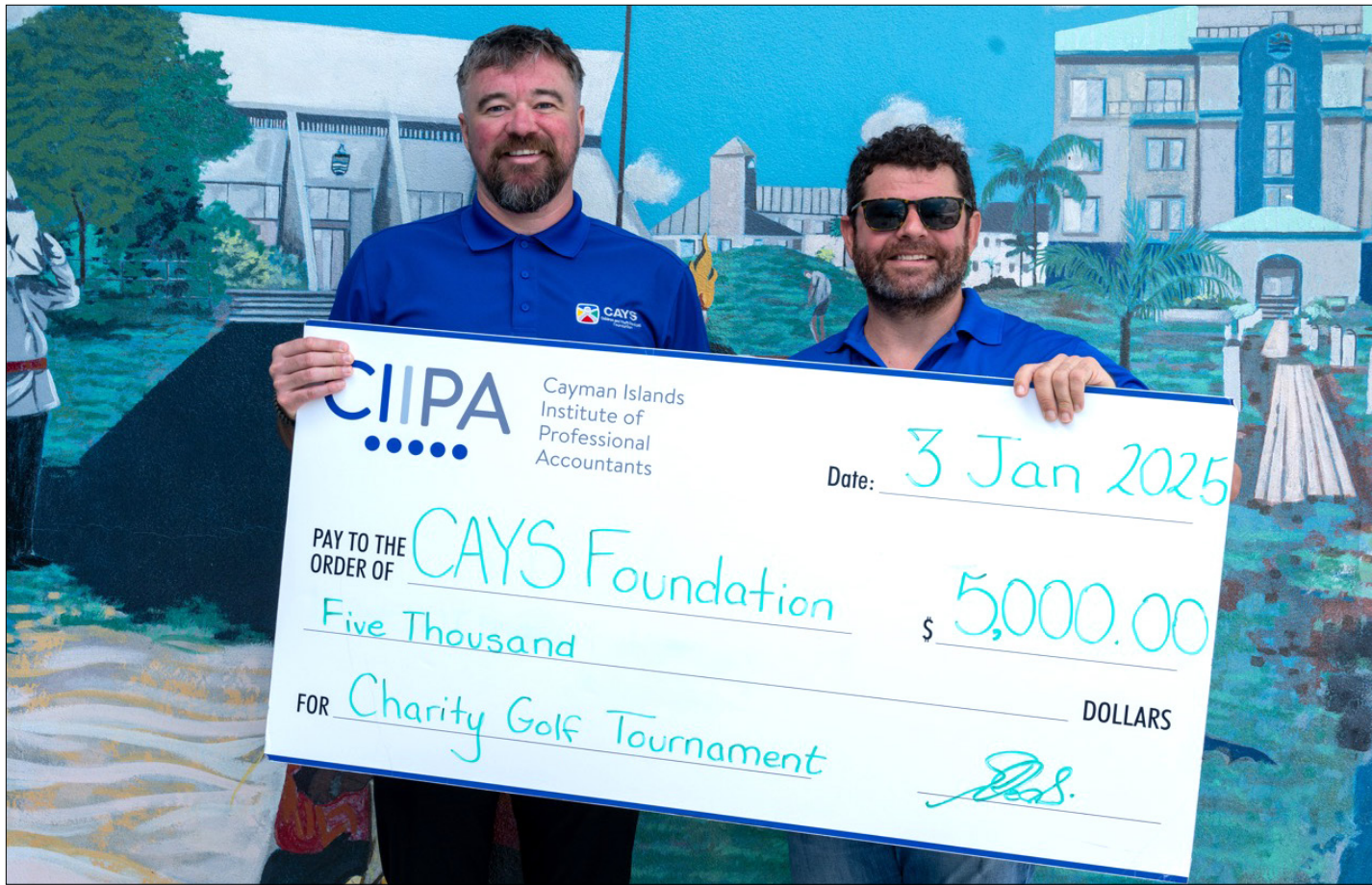
► CIIPA annual Charity Golf Tournament raised KYD $5,000

The Cayman Islands Institute of Professional Accountants is proud to have recently donated KYD $5,000 to the CAYS Foundation, proceeds from its annual