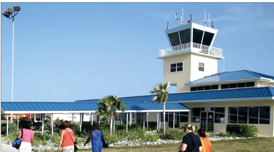
► Captain Charles Kirkconnell Airport

On Thursday, 16 January 2025, Customs and Border Control Service (CBC) officers arrested a Cayman Islands resident upon his arrival at Charles Kirkconnell International Airport.