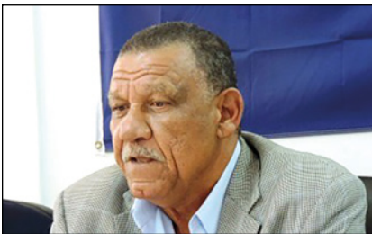
Flashback – September 2019: Opposition Calls Cruise Berthing Referendum A Fight for Democracy