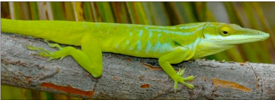
► Little Cayman Anole (endemic)