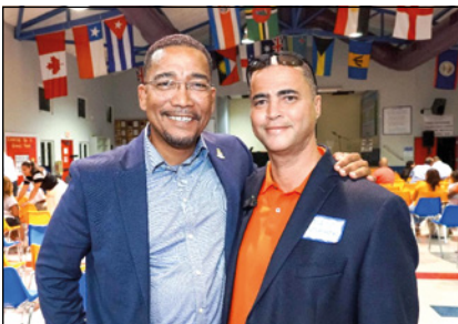
ACT Leads Urgent Call for Cruise Berthing