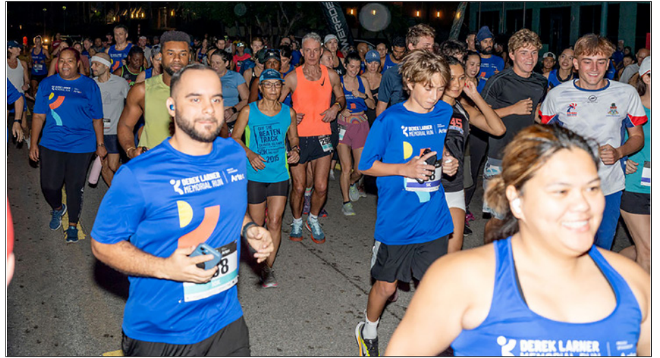
► 5K and 10K runners